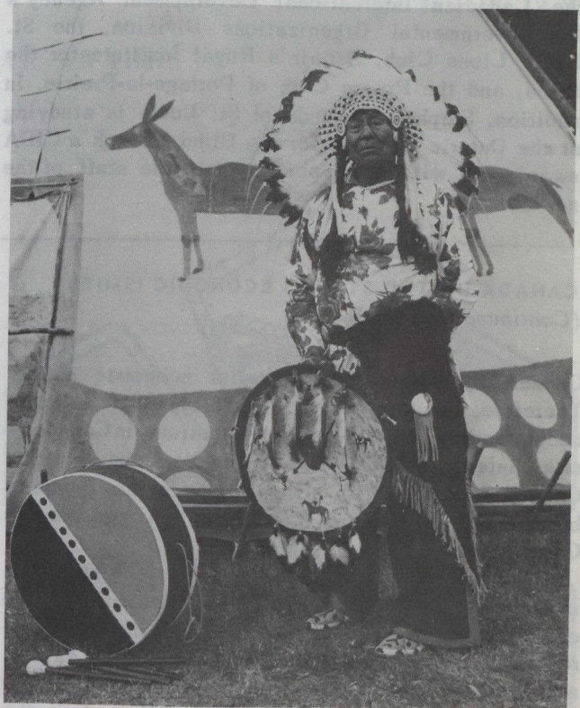
A Plains Indian Chief at the Calgary Stampede

Among the Plains tribes were the Blackfoot, the Sarsi the Plains Cree, the Assiniboin, and the Plains Ojibwa. These shared a general culture, though their spoken languages were of three distinct stocks: Athapaskan, Siouan and Algonkian. Ranging over the primary habitat of the bison in Canada they occupied the southern reaches of Manitoba, Saskatchewan, and Alberta to the foothills of the Rocky Mountains.