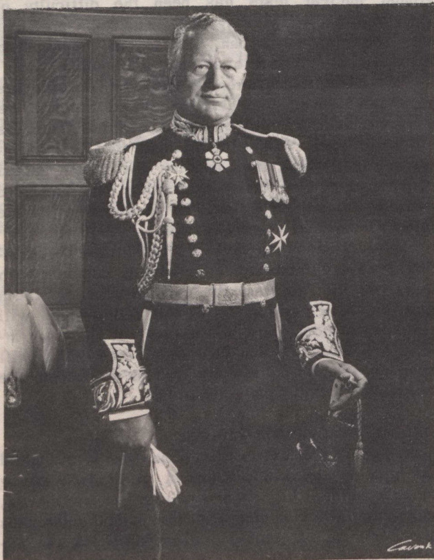
The Right Honorable Roland Michener, Governor General of Canada

History, geography and economics have placed certain of our citizens at a disadvantage. Under legislation enacted during the last session of Parlia-