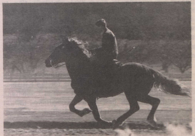
Flying hooves, flying mane, flying tail.