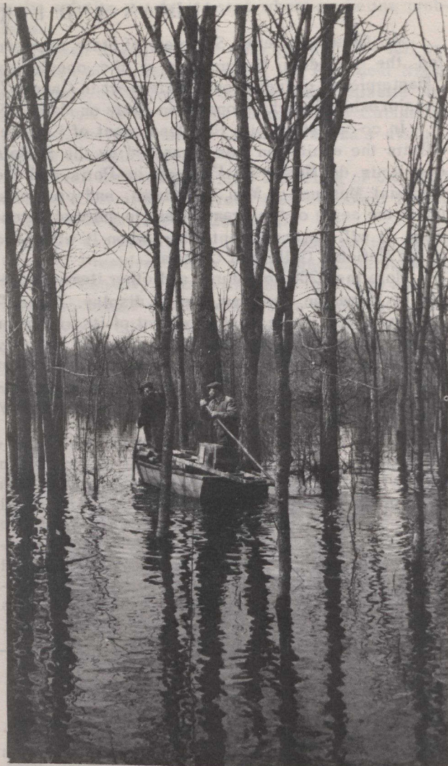
Getting ready to set up a nesting-box for wild ducks.