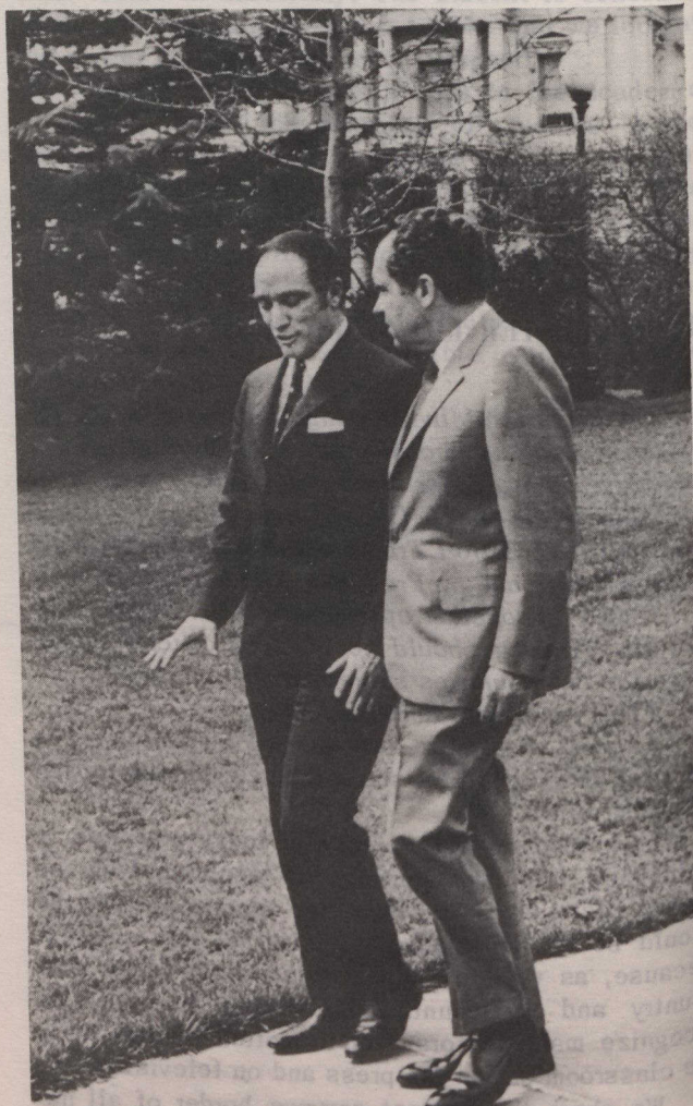
Prime Minister Pierre Elliott Trudeau and President Richard Nixon stroll in the grounds of the White House after two days of talks on March 24 and 25.

I do not wish to sit down without saying that I found in President Nixon a warm and understanding friend of Canada, a man with whom I shall be able to speak on behalf of Canadians in a frank yet genial fashion. For this I am very thankful. To further this good beginning I extended to the President and to Mrs. Nixon a warm invitation to visit Canada at their earliest convenience.