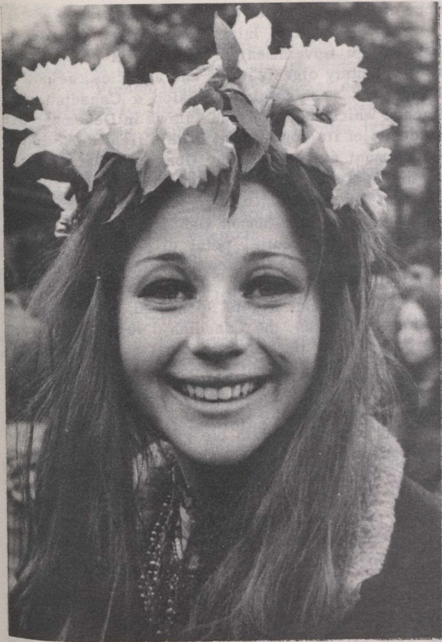
"Flower-child" in Vancouver's Stanley Park.