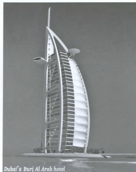
Dubai's Burj Al Arab hotel

Dubai, United Arab Emirates, December 4-6, 2006 > Over the past two years, Cityscape—the international property investment and development event—has featured Canadian engineering and architectural capabilities.