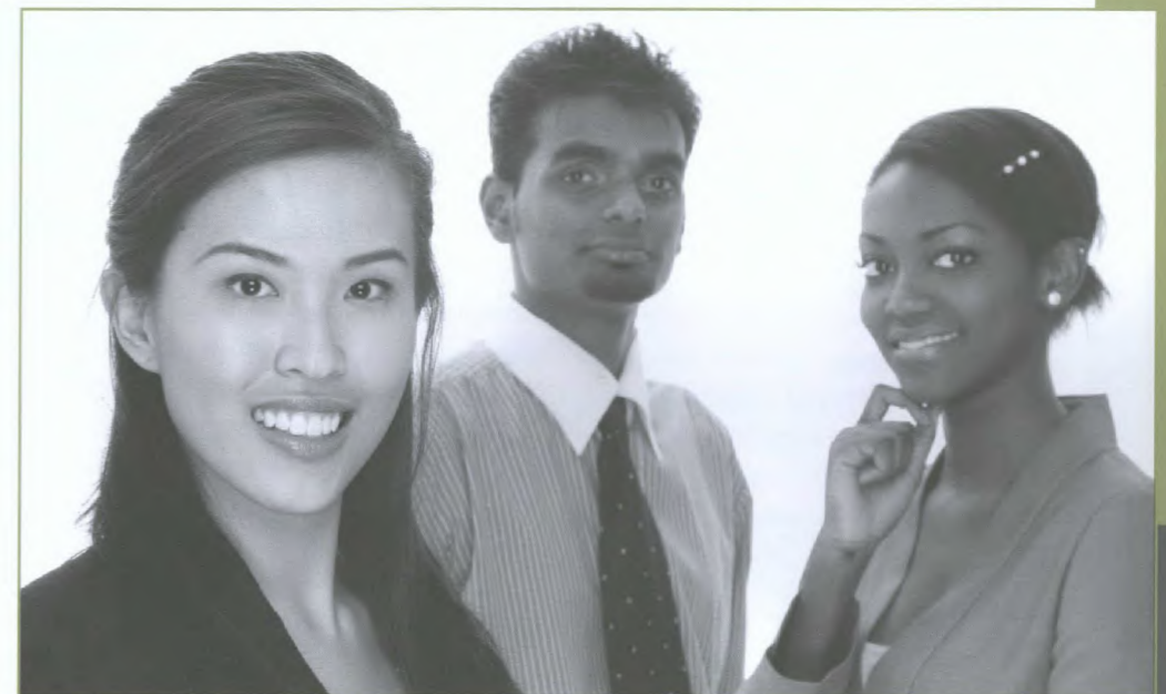
Opportunities are growing for "diversity suppliers" in the U.S.

In addition to the product display, the 25 companies obtained excellent information from their scheduled