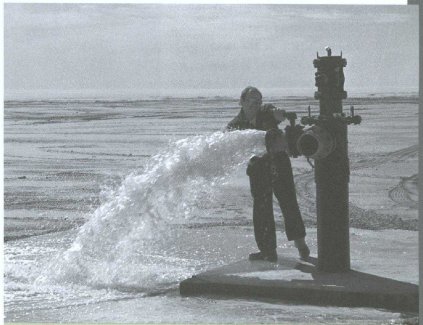
It's no mirage: SNC-Lavalin dug 700-metre-deep wells in the Saharan desert to tap Libya's aquifers. Opportunities abound for other Canadian firms.

In 2000, after early success in the U.S. market, Ontario-based Pressure Pipe