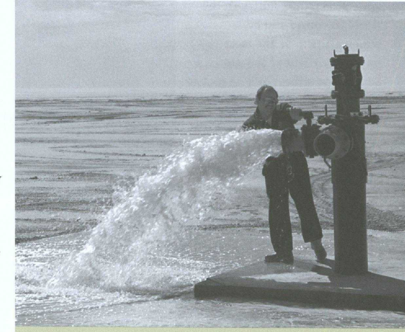
It's no mirage: SNC-Lavalin dug 700-metre-deep wells in the Saharan desert to tap Libya's aquifers. Opportunities abound for other Canadian firms.

In 2000, after early success in the U.S. market, Ontario-based Pressure Pipe