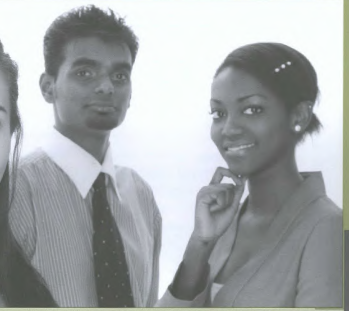
Opportunities are growing for "diversity suppliers" in the U.S.

In addition to the product display, the 25 companies obtained excellent information from their scheduled