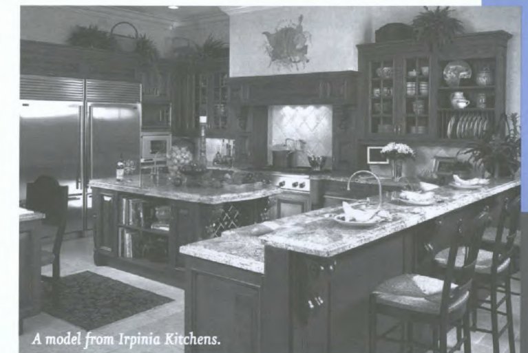
A model from Irpinia Kitchens.