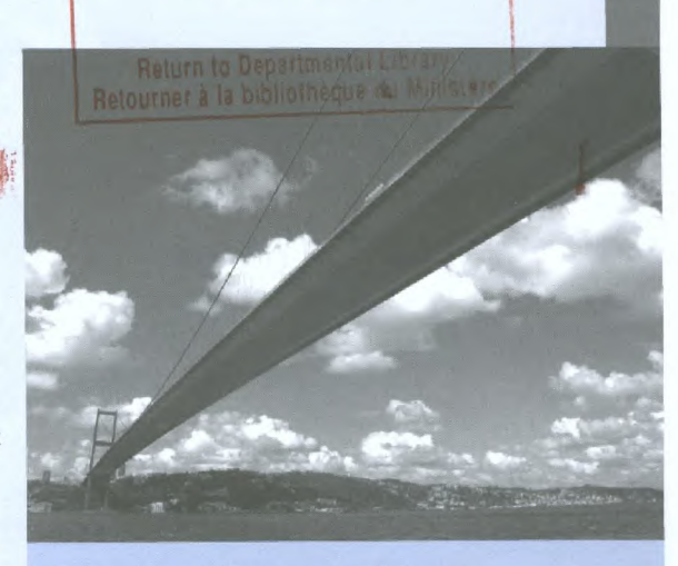
Bridge over the Bosphorus, Istanbul.