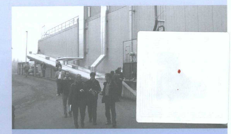
The Canadian delegation visited biogas plants in southern Germany and Austria.

In fact, this is one of the most effective methods of converting biomass to energy. The methane in biogas can be used to either fuel electrical generators or, with suitable