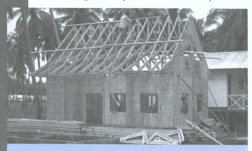
Canadian companies have contributed 10 wood-frame homes to the Labui Eco-Village in Banda Aceh, Indonesia.

for proper shelter construction. Intermap recently received funding from the Canadian International Development Agency (CIDA) to expand its technology transfer to Indonesia by training Indonesian GIS technicians to use radar data for the construction of topographic line maps.