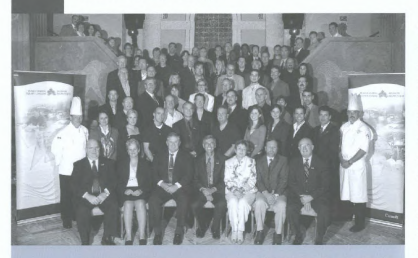
The Canadian delegation poses for an official group photo during the Team Canada Atlantic follow-up trade mission to Chicago.

Chicago, Illinois > Team Canada Atlantic (TCA), a partnership of federal departments and the four Atlantic Provinces, has once again organized a successful trade mission to the greater Chicago marketplace this past October. This mission built on the success and momentum established during the first mission that was held in April 2005.