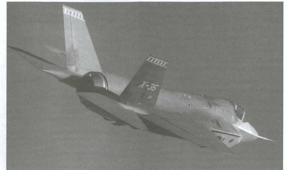
New Brunswick's Applied Courseware Technology won a contract with Lockheed Martin's $270 billion F-35 Joint Strike Fighter project.

When the company began expanding into the U.S. and Europe, ACT