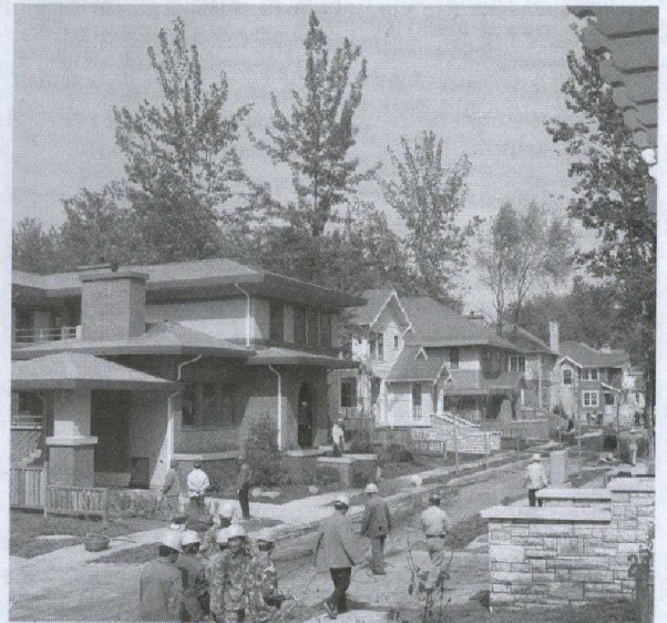
Ekistics' Street of Dreams project in Beijing

continued on page 5 — Canadian architects