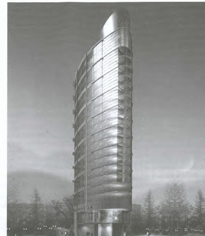
The Jiangjin Hotel by Vancouver's Nicolson Tamaki Architects

Chinese consumers are very brand-conscious, and a large company with a well-known brand name is a much