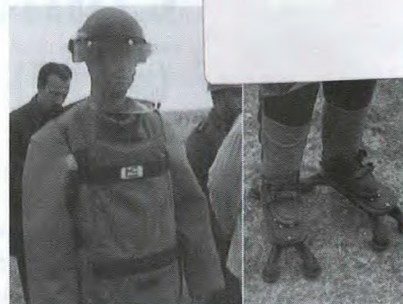
Med-Eng Systems Inc.'s HDE full body protective suit, HDH demining helmet and spiderboots.