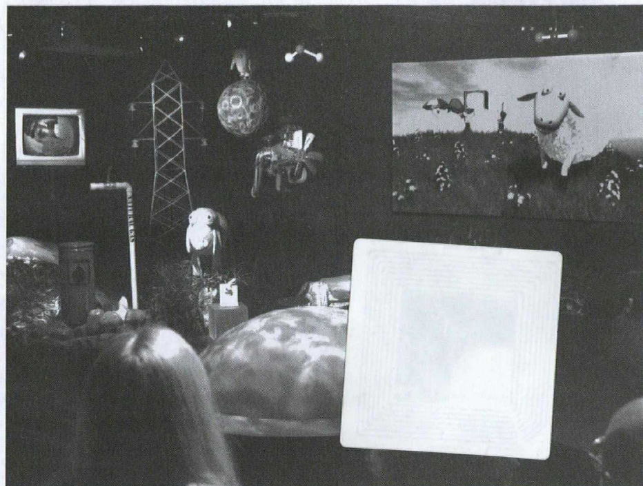
The Climate Change Show, Sudbury-based Science North Enterprises' object theatre exhibit

The mission also tied into the annual National Manufacturing Week Trade Show, which is the premier manufacturing fair in North America, with six integrated conferences and exhibitions. It features the latest in design, engineering, manufacturing and innovation. Last year, the show attracted some 1,500 companies that presented their products and services to over 30,000 attendees from 48 states and 28 countries. A TNO pavilion showcased the products and services of the delegation and other Northern Ontario companies and organizations.