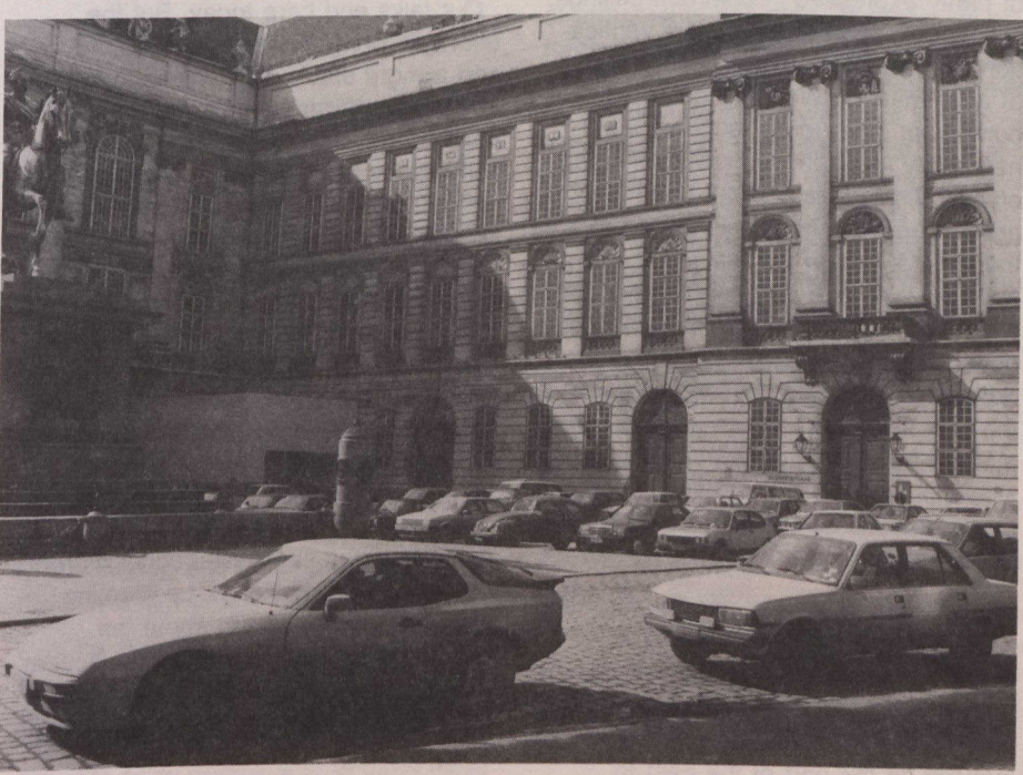
The site of the recently concluded Mutual and Balanced Force Reduction (MBFR) talks in Vienna.

some important problems remain which East and West have not been able to solve. During our negotiations we have identified main areas of particular difficulty being the data problem, the modalities of verification, the geographical factor and the question of the treatment of armaments. These points are well known to all of us. At this moment, it is enough for me to remark that for the West these areas of disagreement touch upon fundamental requirements for its security. It is not a simple matter of negotiators having failed to find some suitable compromise formula. Rather, these problems require a durable solution which does justice to the West's legitimate security requirements, contributes significantly to the strengthening of peace and security, and at the same time increases confidence between the participants. In this sense, the issues we have not been able to resolve here around this table might well prove to have a wider sig-