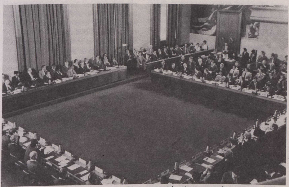
A general view of the Conference on Disarmament in plenary session.

But before a start can be made in this regard, we must know what international security means as it relates to the uses of space. International security, as Ambassador Marchand has recently pointed out, implies not only the absence of weapons as such in outer space, it entails the responsibility of the two major space powers to maintain a stable, controlled relationship between themselves on space issues. This means that all efforts to consider the relationship between international security and outer space are predicated on the enhancement of stability. It is our job to identify measures concerning the use of outer space that can be taken on a multilateral basis and through consensus, and that will enhance stability, admittedly a daunting task. That is all the more reason to ensure that the first step provides a strong building block from which further proposals can proceed.