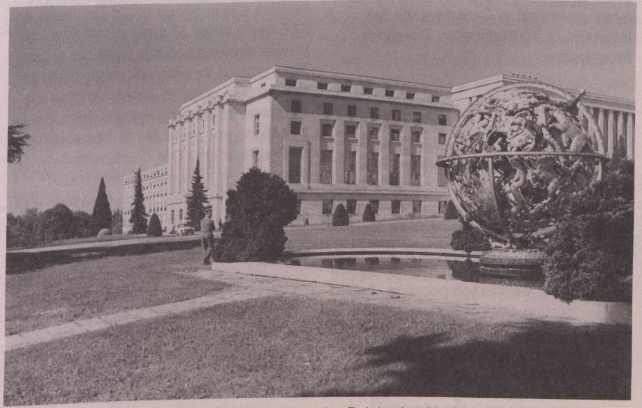
The Conference on Disarmament meets at the Palais des Nations in Geneva, the European office of the United Nations. Before the Second World War, the Palais des Nations was the headquarters of the League of Nations and the scene of a number of historic events.

Another important point I wish to register relates to suggestions which have been made, here and at the Paris Con-