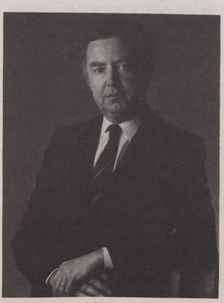
The Secretary of State for External Affairs, the Right Honourable Joe Clark.

When frames of reference collapse, when some tried and true concepts are tested, when old limits shatter and new horizons emerge, the intuitive response is often to deny the change or to say