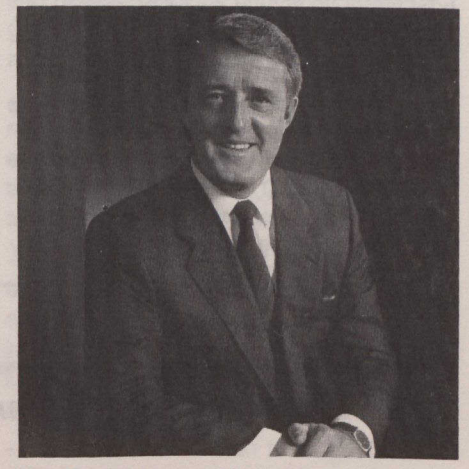
The Right Honourable Brian Mulroney, Prime Minister.

part of the Soviet Union and its Warsaw Pact Allies.