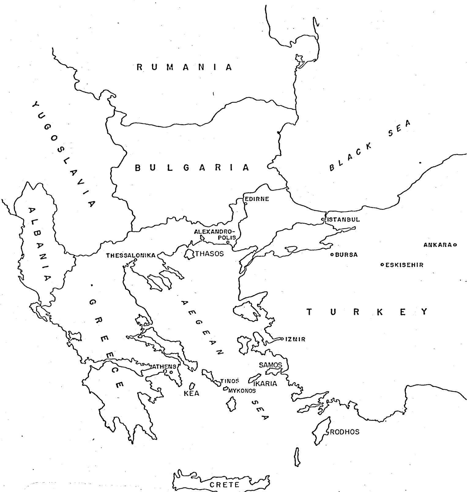
APPENDIX I MAP OF THE REGION