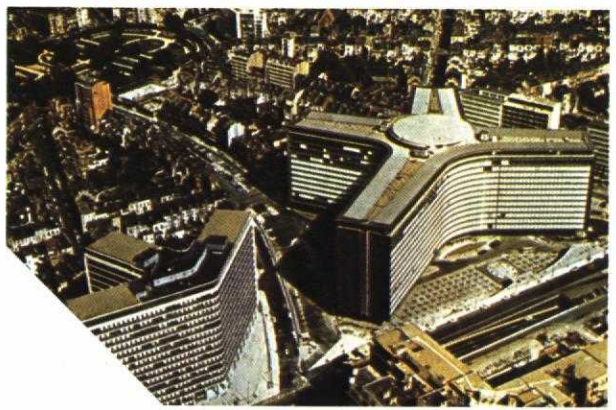
EC Headquarters in Brussels