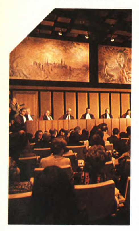
The Court of Justice