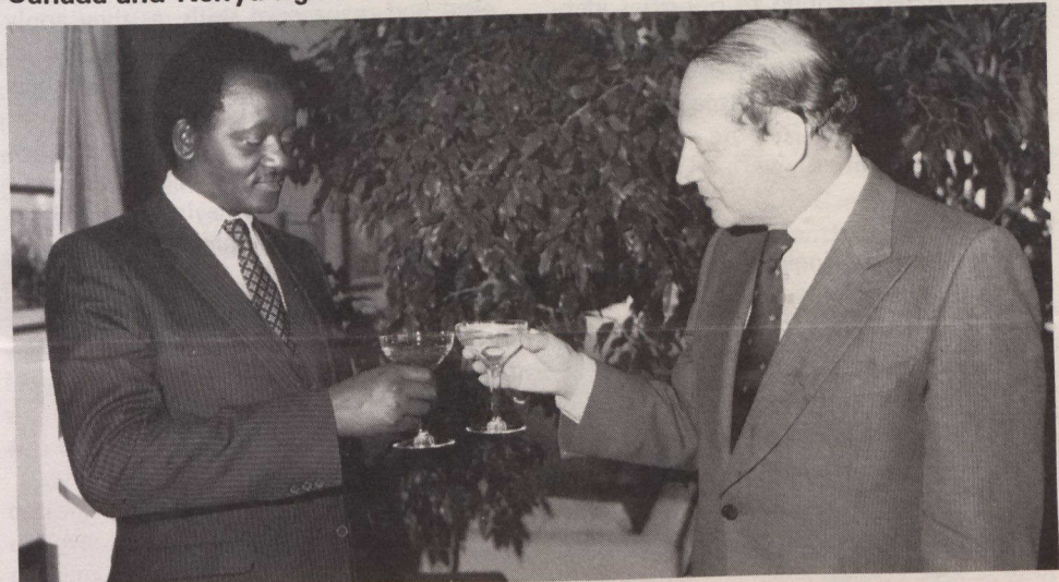
Minister Regan (right) and Minister Magugu toast signing of agreement.

Canada and Kenya have signed an agreement to avoid double taxation. The agreement was signed in Ottawa, April 27, by Minister of State (International Trade) Gerald Regan and Kenya's Finance Minister Arthur Kinyanjui Magugu.