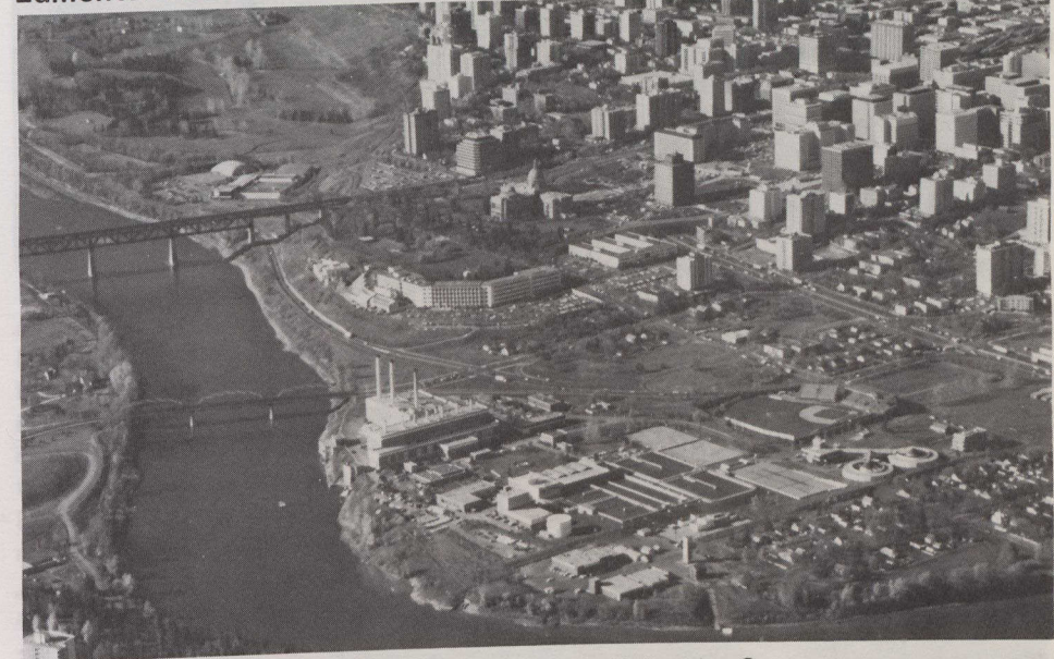
Edmonton, capital of Alberta, is the site of World University Games.

Edmonton hosts World University Games this year