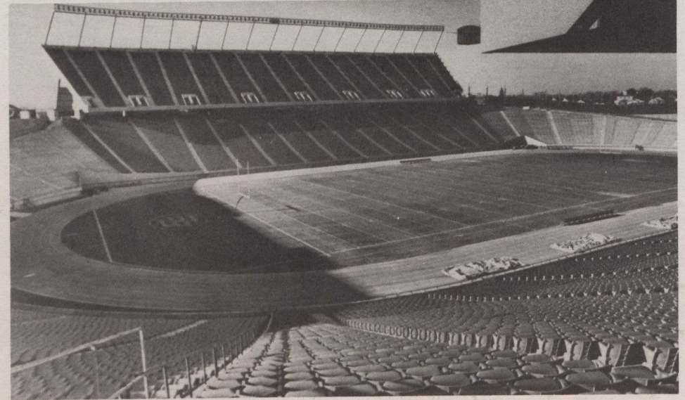
Track and field events will be held at Commonwealth Stadium.

For information on the games write to Universiade '83, P.O. Box 2650, Edmonton, Alberta T5J 2G4, Canada.