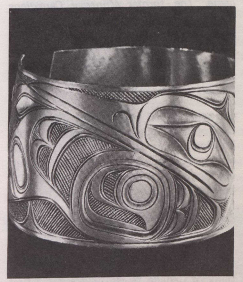
A silver Haida bracelet by Charles Edenshaw, before 1908.

porary works from all eight major coast tribal groups - Haida, Tlingit, Tsimshian, Northern and Southern Kwakiutl, Bella Coola, Westcoast and Coast Salish, are displayed and contrasted to show the evolution of styles and traditions.