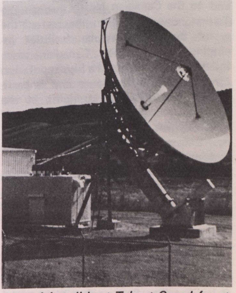
A receiving dish at Telesat Canada's network television station in Qu'Appelle, Saskatchewan.

Canada's telephone network, which connects more than 19 million telephones, is rapidly converting to the digital mode to take full advantage of the reliability and economics of this new technology. Canadian telephones in service are more than 60 per 100 population, making Canada number four in the world in terms of number of phones per 100 population.