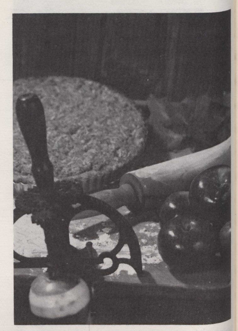
Apples are Canada's biggest fruit seller.

In 1980, about 43 per cent of the total Canadian apple crop was processed. Of this, 80 per cent was used to produce pure apple juice and concentrate. Per