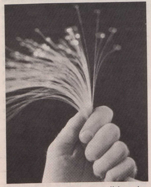
Because optical fibres carry light pulses rather than electricity, they are not disrupted by such things as lightning or power lines. They are made of silica, a basic constituent of ordinary sand.

Fibre optics has been used in communications in Canada since 1976 and many field trials have been undertaken. As a result, Canadian industry has a leading position in this new technology. Applications include a residential area of Toronto where households are being used to show the practicability of simultaneous transmission of telephone, data and television