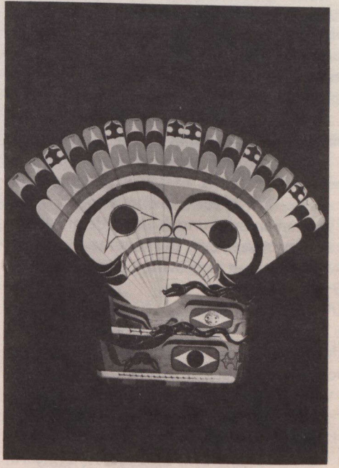
Lightning snake and sun transformation headdress by Tim Paul, 1980.

A richly illustrated catalogue containing colour reproductions and informative essays on the art and artists has also been produced for the exhibition.