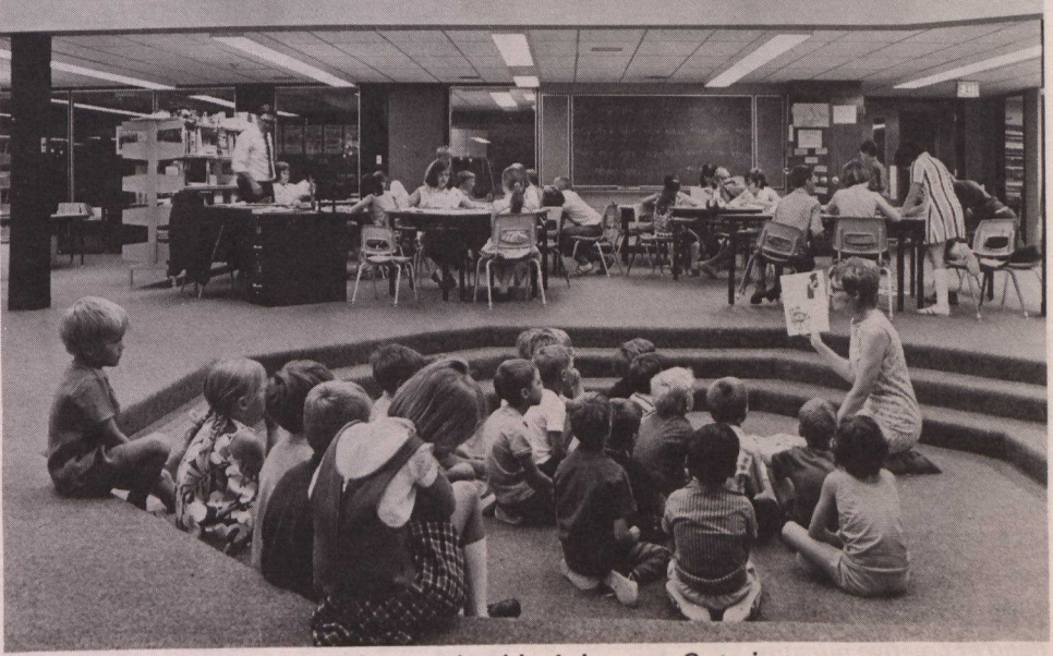
An open-concept class at a primary school in Agincourt, Ontario.

Provincial ministries of education set standards, devise curricula and provide grants to educational institutions. Elected school boards at the municipal level set local budgets, hire and negotiate with teachers and determine elective parts of the curricula. These boards are responsible for elementary schools (grades one to