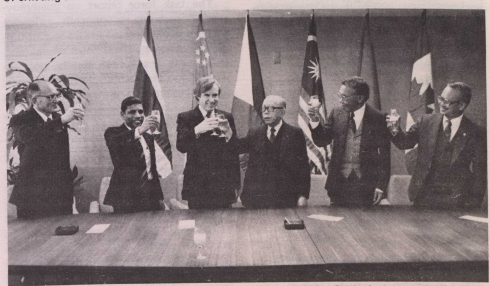
A toast to the Canadian-ASEAN agreement for co-operation in the industry, development and commerce sectors: (left to right) Thai Foreign Minister Siddhi Savetsila, Singaporean Foreign Minister Suppiah Dhanabalan, Secretary of State for External Affairs Mark MacGuigan, Philippine Foreign Minister Carlos Romulo, Malaysian Foreign Minister Tan Sui Ghazali Shafie and Indonesian Foreign Minister Mochtar Kusumaatmadja.

Canadian links with the ASEAN nations have grown since they were first established in 1975 and have complemented the bilateral relationships which Canada has long maintained with the member countries. Two-way trade between Canada and ASEAN totalled $1.14 billion (Cdn.) in 1980.