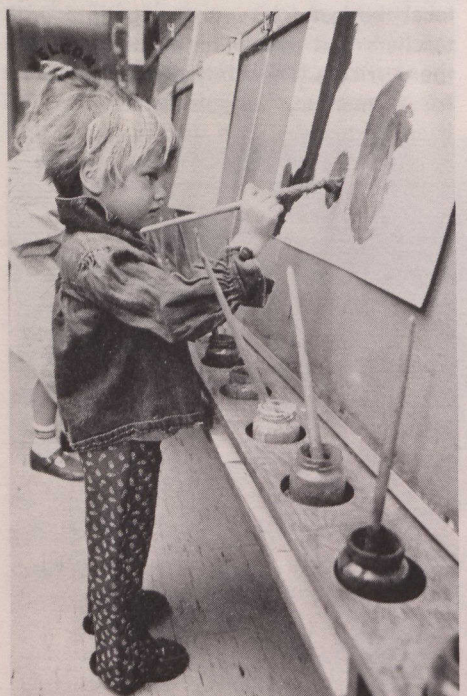
A young kindergarten student tries her hand at creative pursuits.

Canada's educational systems offer free schooling to some five million children throughout the country. Formal education often begins at the nursery-school level, and it continues, in most cases, for at least ten years. Each province sets the length of its programs as well as the