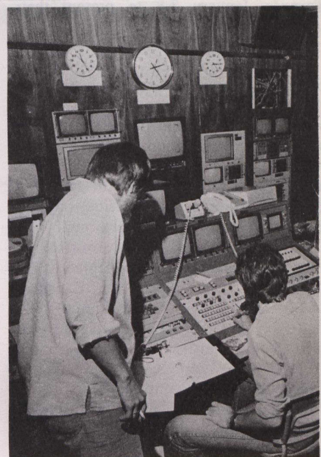
The medical symposium's busy production centre in Toronto.

In all four cities — Vancouver, Toronto, Montreal and Halifax — doctors gathered in front of television monitor screens in hotels to watch three hours of speeches, discussions and interviews from conference centres. In other communities across Canada, doctors and others could watch local cable TV stations within the Cable Satellite Network, even joining in with questions to speakers over telephone lines specially linked to the centres.