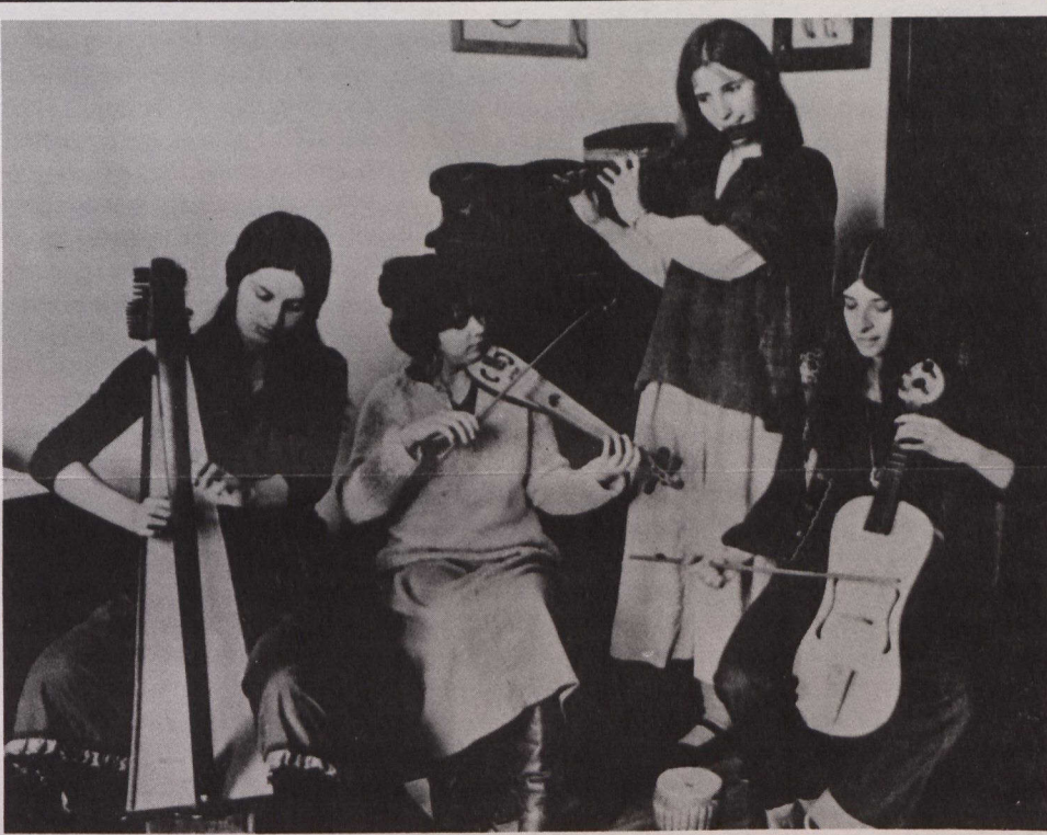
The Sanz Cuer group plays music of the twelfth to fifteenth centuries.

The instruments played by the members of Sanz Cuer are modern reconstructions of instruments depicted in paintings or kept in museums.