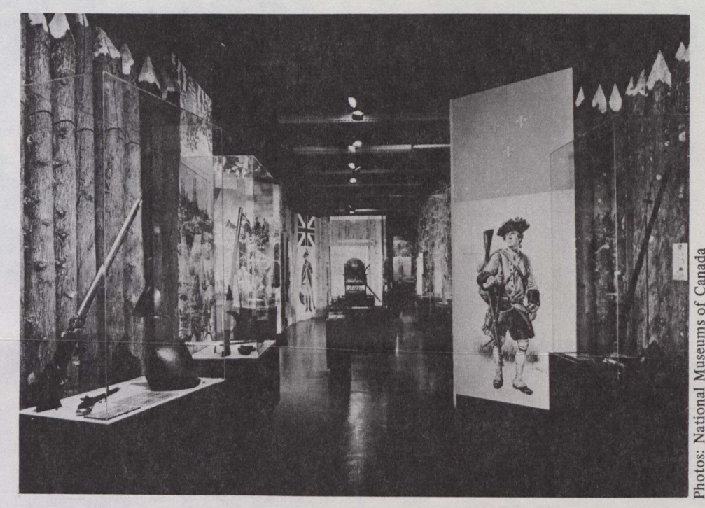
View of first-floor display at Canadian War Museum.

This is accomplished through the use of display cases, pictures, dioramas, audio-visuals, airplanes suspended from ceilings, artwork and reconstructed scenes such as a World War I trench, complete with sandbags, battle sounds and shell flares, through which visitors can walk. All types of weaponry from muskets to huge tanks are also displayed. In addition, the staff car used by Herman Goering during the Second World War is exhibit-