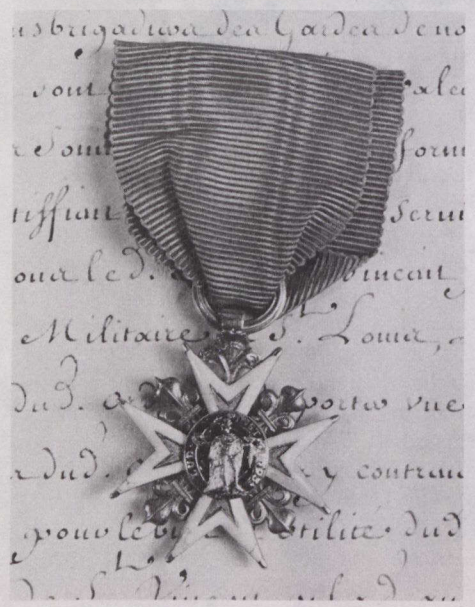
The Cross of Saint Louis instituted by Louis XIV in 1963 was awarded for distinguished service in the armies of France. The first native-born Canadian to receive the cross was Pierre Le Moyne d'Iberville in 1699.

Since 1880 when it started as a small group of trophies and collectibles, the Canadian War Museum has grown to include exhibits ranging from the earliest North American Indian weaponry to modern twentieth-century missiles. While the museum had collected and stored books, records and artifacts since 1880, it was not until 1942 that the first permanent exhibit was opened to the public.