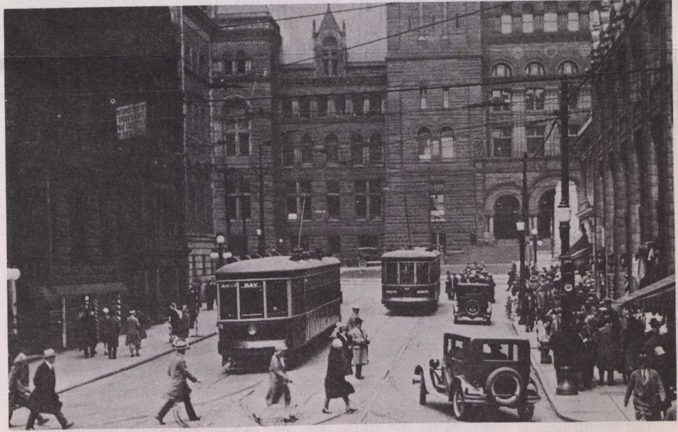
Electric railways were well established in Toronto by the time this photograph was taken; it was back in 1883 that the first practical electric railway came into use.