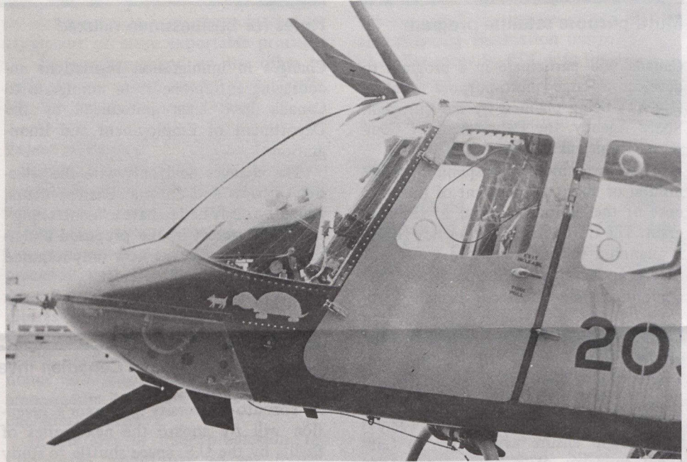
Canadian Armed Forces

A study, which began in April 1977, led to the development of the basic Wire Strike Protection System (WSPS).