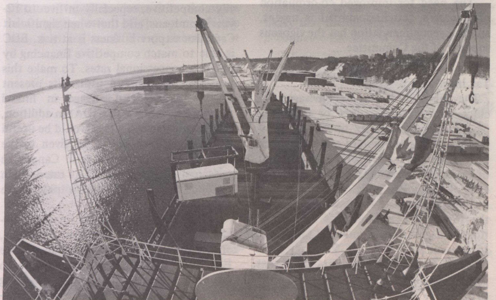
Increased exports are aim of the Committee's final report.

As part of that fundamental commitment, Canada's export support services need to be co-ordinated on an ongoing basis, and