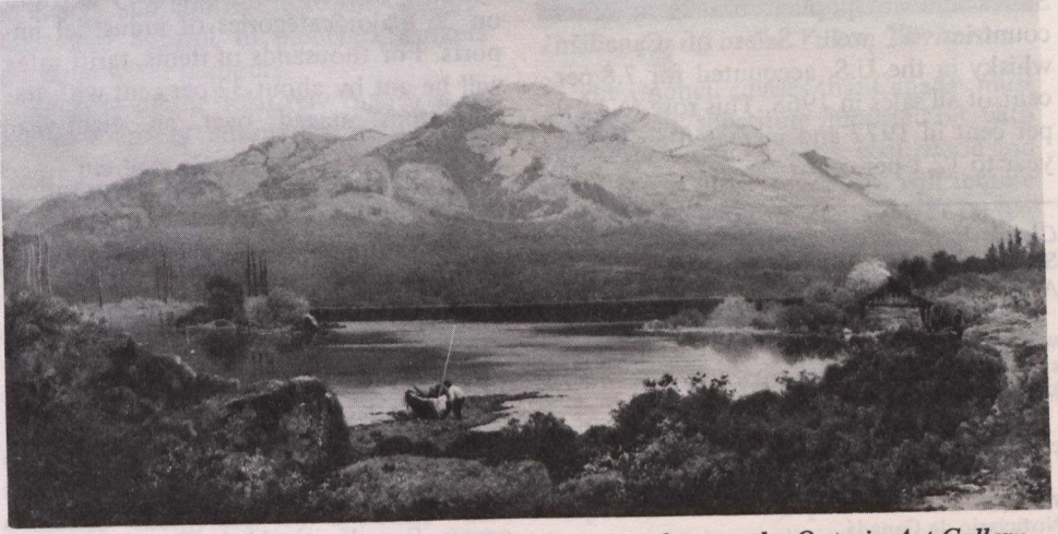
Laurentian Splendour, a landscape by John Fraser on show at the Ontario Art Gallery.

As well as showing an intense interest in Canada's national development, artists were also challenged and inspired by the new art of photography. Among the photographs in the exhibition are several by William Notman. Their tonal range, varied texture and clarity of detail inspired such paintings as Lac-des-Deux-Montagnes , 1860, by Otto Jacobi and Mount Orford, Morning , 1870, by Allan Edson.