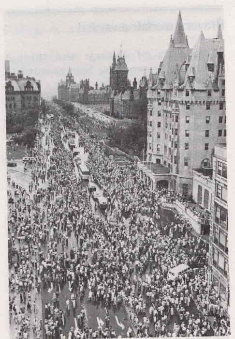
Spectators lined the streets of Ottawa and Hull to view the Canada Day parade.

"Canada has achieved its greatest moments when we have recognized the value of the diversity with which we have been blessed," said Mr. Clark