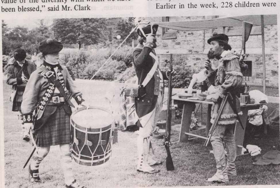
In front of the War Museum in Ottawa a group re-enacts a day in the life of the 84th Loyal Scottish Regiment who distinguished themselves defending Quebec in 1775.

In Toronto, the Queen Mother attended a Canada Day picnic with Premier William Davis on the grounds of the Ontario Legislature at Queen's Park. The 25,000 people who turned out for the picnic consumed five tons of hot dogs and 2,000 gallons of pop. About 1,500 Ontario churches and town halls rang their bells for 112 seconds at 1:12 p.m. in honour of 112 years of Confederation.