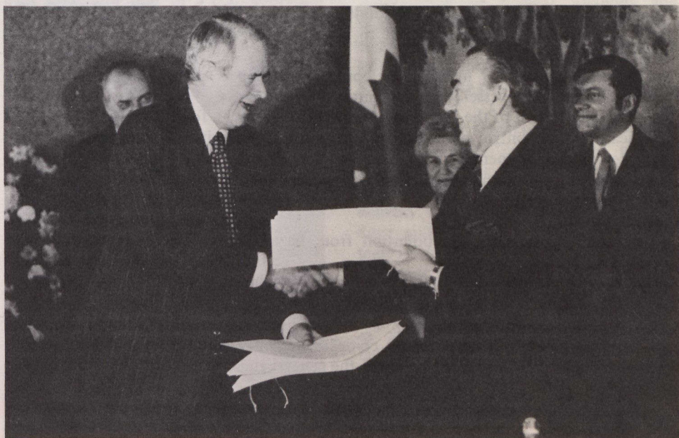
U.S. Secretary of State Cyrus Vance (left) and Secretary of State for External Affairs Don Jamieson shake hands after signing the 1978 Great Lakes Water Quality Agreement in Ottawa, on November 22, during Mr. Vance's visit.

Mr. Vance paid tribute to Canada as a peacekeeper. "Canadians," he said, "have made a greater contribution to interna-