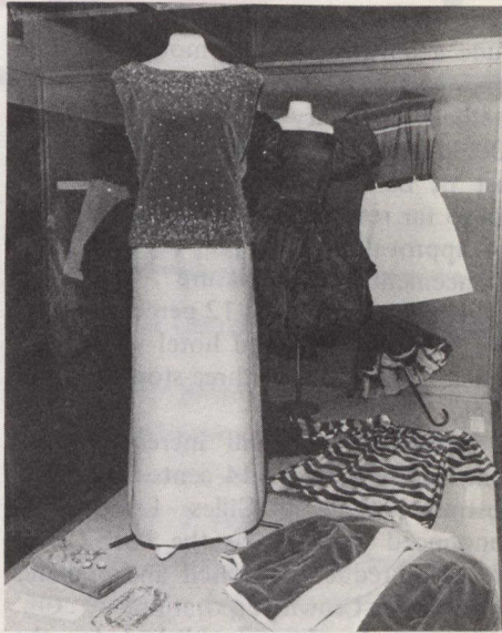
Evening ensemble of 1964 and the dark cocktail dress of 1956 show the New York influence prevalent in Canada at the time.

lingerie and bathing suits are also included. French silk rompers from the Thirties and stretch jumpsuits from the Seventies provide a particularly interesting contrast in children's wear. Make-up, accessories, hairdressing and beauty aids complete the "documentary".