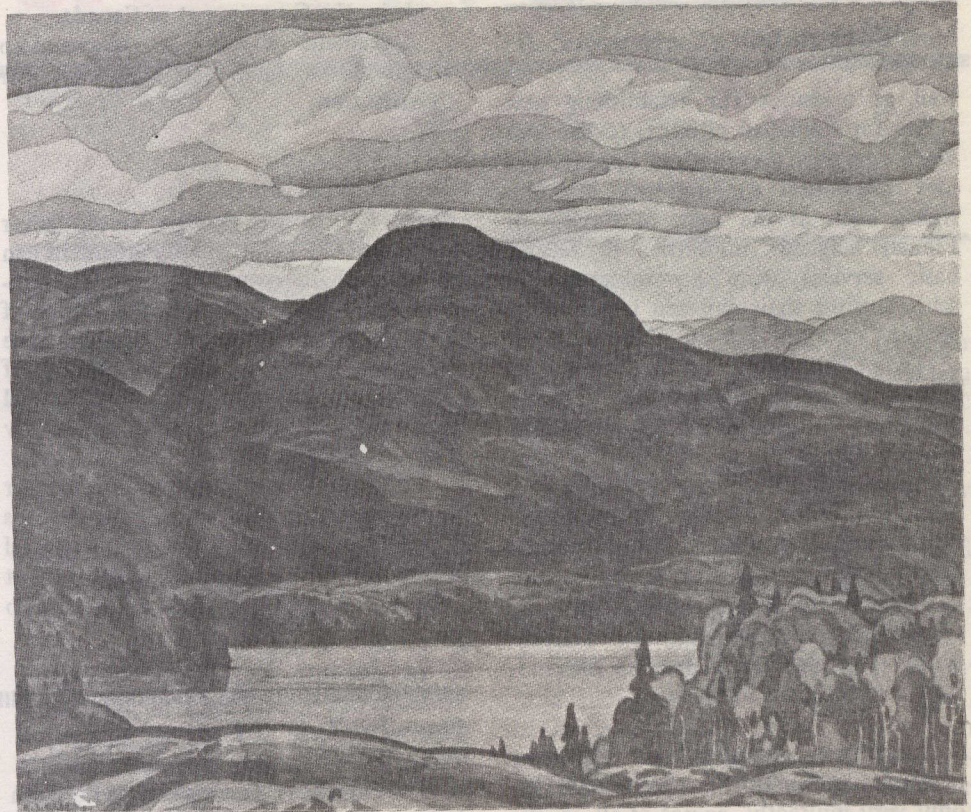
Casson painted Pike Lake in 1929.

For many years, he joined his career as a painter with that of a designer and executive for Sampson-Matthews Limited, a Toronto printing house, where Carmichael and other distinguished Canadian painters were employed. There, Casson created some of the most outstanding commercial art ever produced in Canada.