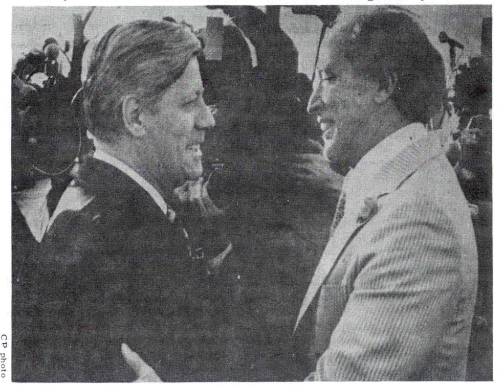
Prime Minister Trudeau welcomes Chancellor Schmidt in Vancouver on July 6.

The new bill also allows head offices of certain business enterprises