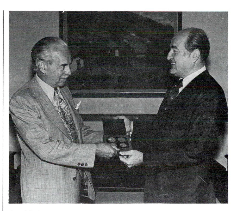
Canada's Observer to the Organization of American States, Alfred Pick, pre-

The coins are historic. They are the first $5- and $10-sterling coins minted anywhere. The series contains four coins depicting the host city, the yachting centre at Kingston, Ontario, a map of North America, and a map of the world symbolizing the universality of the Games.