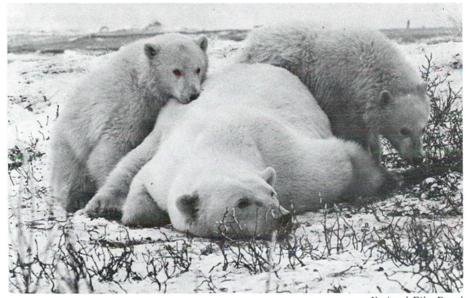
Polar bear mother and cubs in Churchill, Manitoba.

Unlike the situation in other signatory countries, where the species is considered endangered, the population in Canada is thought to be healthy. Con-