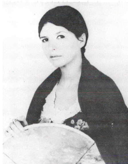
Princess Alanis Obomsawin

Students visiting the Ottawa area may lunch with Alanis Obomsawin, Indian princess, film director and singer, in the National Arts Centre Studio, weekdays from May 13 to 31. The occasion is the Youth Division's presentation "Arts of the North American Indians", an exhibition of Indian arts and handicrafts, a one-hour presentation of films, Indian legends and native folksongs — with Alanis Obomsawin, host — and an Indian lunch of soup and bannick bread,