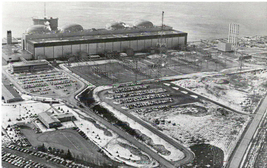
Ontario Hydro's generating station at Pickering.

steadily. Nuclear power was a new factor. By the end of 1973 fossil-fuelled generation, coal and natural gas, represented 42.3 per cent of Hydro's resources. Nuclear generation reached 13.1 per cent. Thermal plants, both fossil and nuclear, are expected to represent more than 80 per cent of generation capacity by 1980.