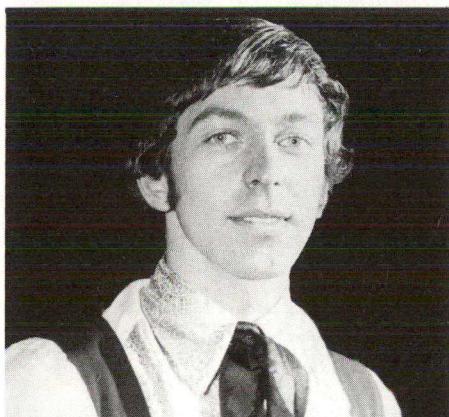
Toller Cranston of Toronto, winner of the men's singles at Skate Canada.

Skate Canada '73, the first of an annual event sponsored by the Canadian Figure Skating Association, is a senior invitational competition in which, this year, 46 skaters from Austria, Britain, Canada, Czechoslovakia, France, Italy, Japan, the United States, the U.S.S.R. and West Germany took part. Judges came from each participating country. The competitions, held from October 25 to 27 in Calgary's Stampede Corral, where the