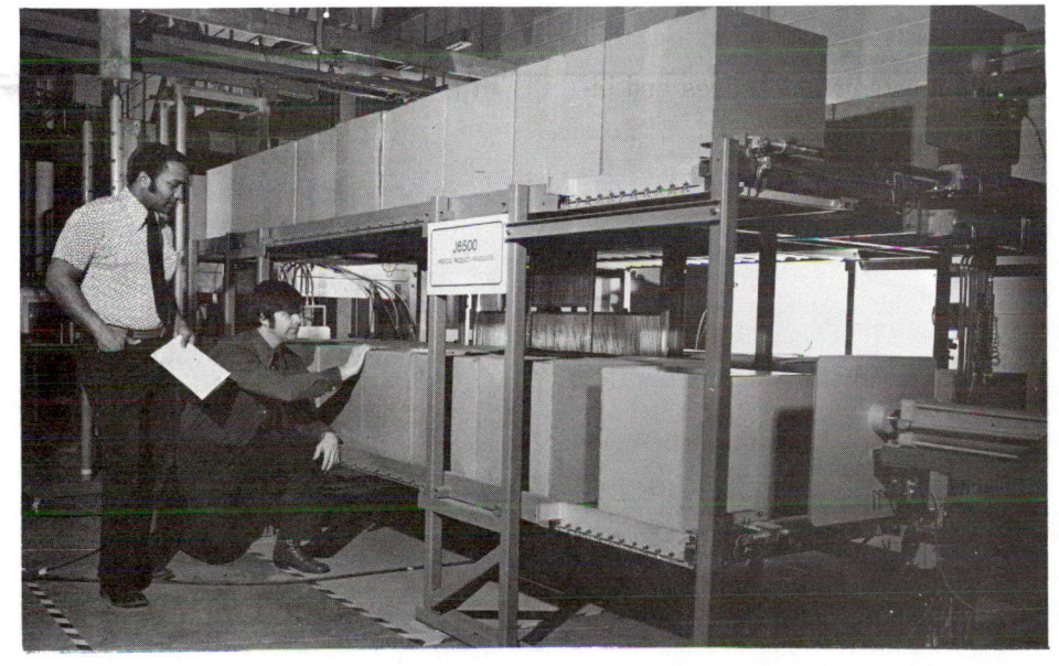
A high-capacity irradiator used for biological sterilization of medical supplies mercial Products Division, Ottawa.

Other radiation-sterilization plants in Canada are Isomedix at St. Hilaire. near Montreal, Quebec, and at Ethicon, near Peterborough, Ontario.