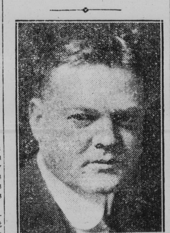
Still Helps Herbert Hoover Troubled Europe

orities, in many cases there being two wites to one in favor. One in favor. One in favor. One in favor. One in favor. One in favor. The city of Vancouver, which at the former referendum was strongly in favor of prohibition gave a writ