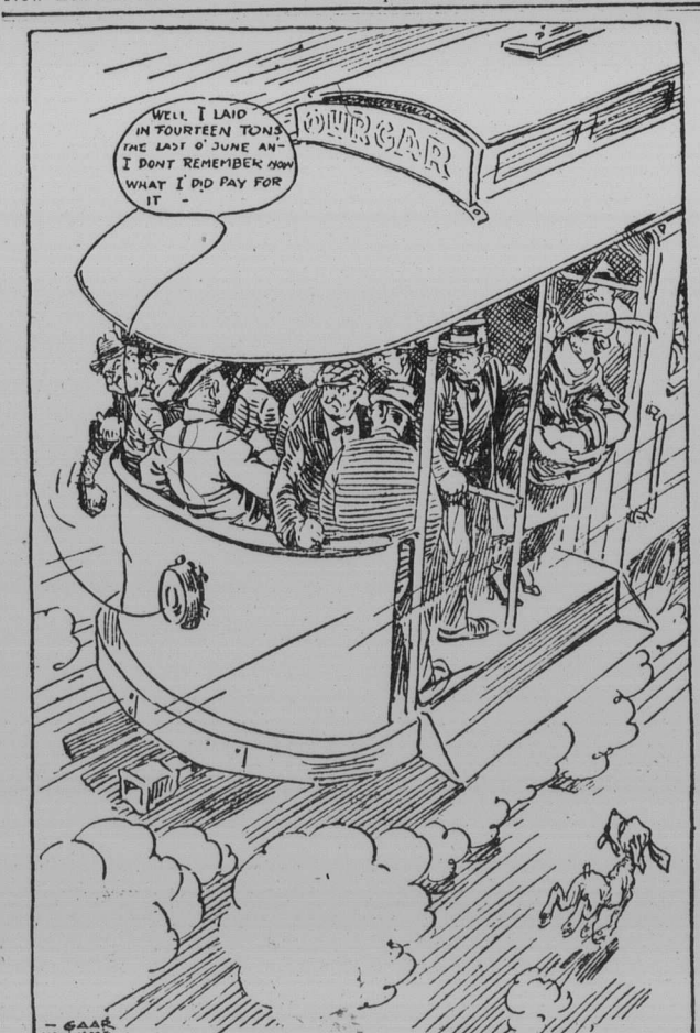
A NEW UNPOPULAR GUY!

marks was known in England as early as 1770. A cube of it half an inch square cost a shilling. Australia is sending one and as 1770.