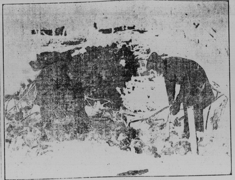
Incident in the Halifax Tragedy.

Two sailors digging for bodies, the one on the left looking for the remains of his wife and two children which he finally found.