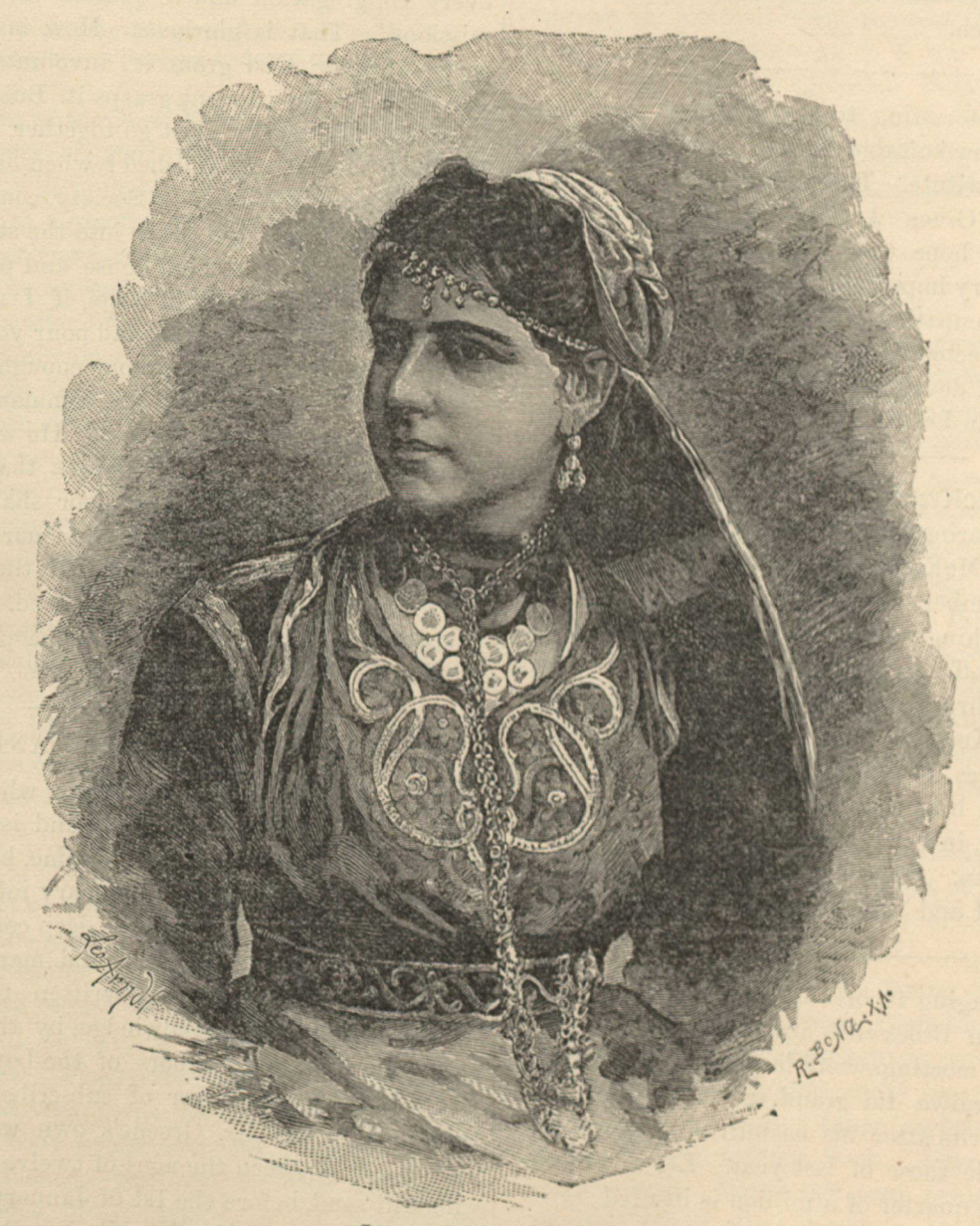
JEWISH GIRL OF MOROCCO.