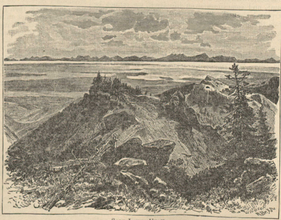
SALT LAKE, UTAH.

This paper will necessarily be incomplete, the subject dealt with is so comprehensive; but there is one other point that we must touch upon. We refer to the habitual neglect of their sick women. It is extremely rare to hear of a male physician being admitted, and undoubtedly many lives are sacrificed an-