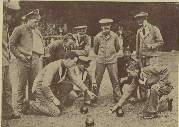
Out-Door Sports A close "End."

On the 22nd, six men were invited to a small Garden Party, with games, music and tea at a small suburban cottage nearby. The owner, although not a wealthy man and having only a small house and garden, wished none-the-less to do what he could in a small way to show his appreciation of our brave Canadian boys.