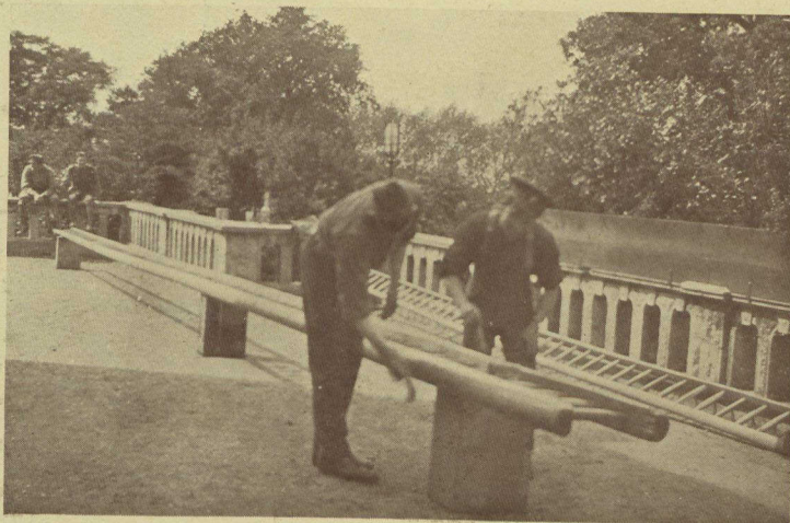
An Artistic Job.