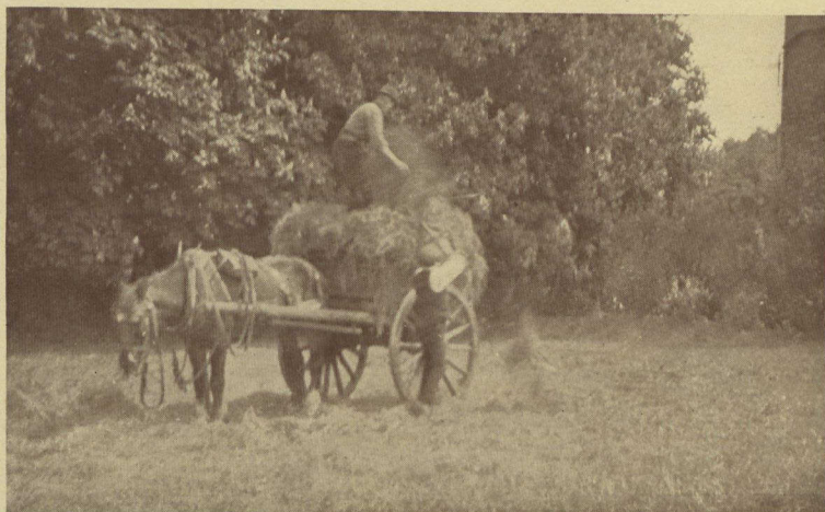
Haymaking at Kingswood.