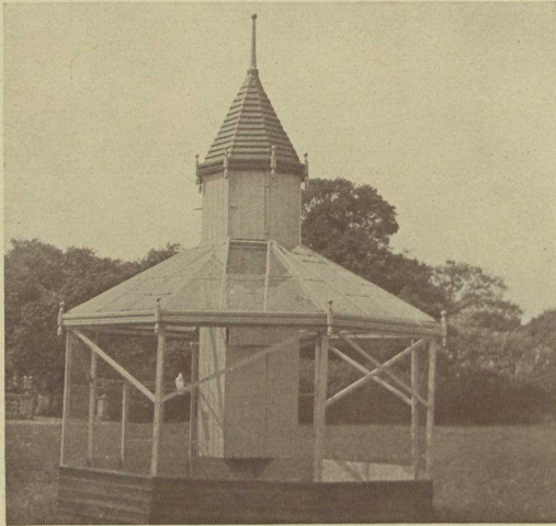
Dovecote on the grounds.

up of those who had been gardeners in pre-war days, and who naturally took great interest in the splendid exhibits of flowers, fruit and vegetables for which this Show has a World-wide reputation.