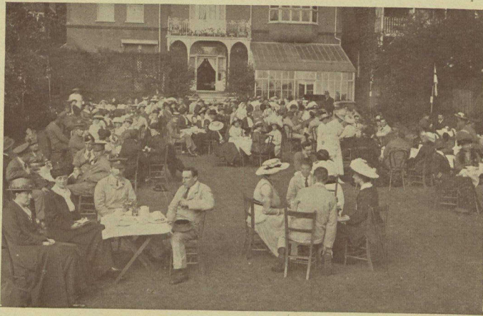
Tea was served on the lawn.