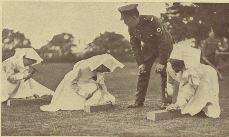
The Nurses engage in a Nail-Driving Contest at July 1st. Games.

This was followed by tea on the Terrace. This is one of the recognized institutions of Parliamentary life at Westminster during the summer months, tea being served to Members and their guests on the broad stone Terrace alongside the Parliament buildings and overlooking the River Thames. One of the members