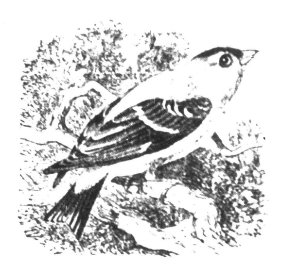
GOLDFINCH (Spinus tristis L.