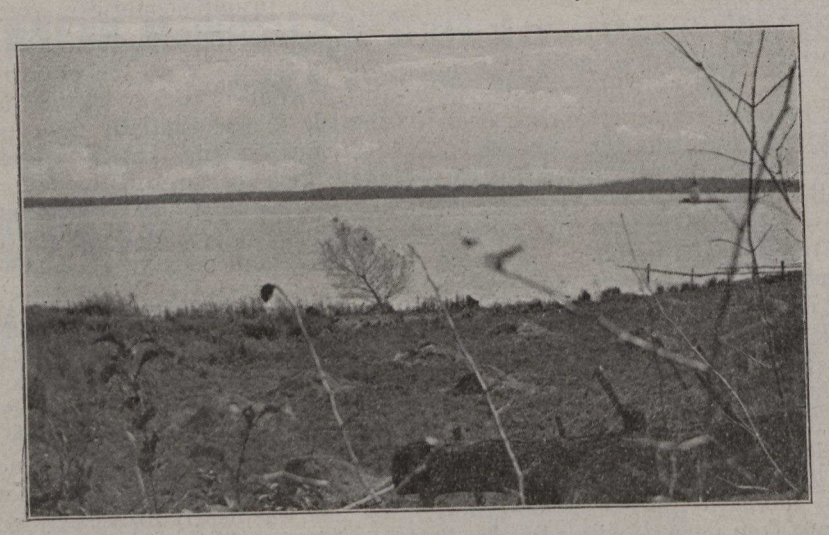
View of St. Lawrence River.