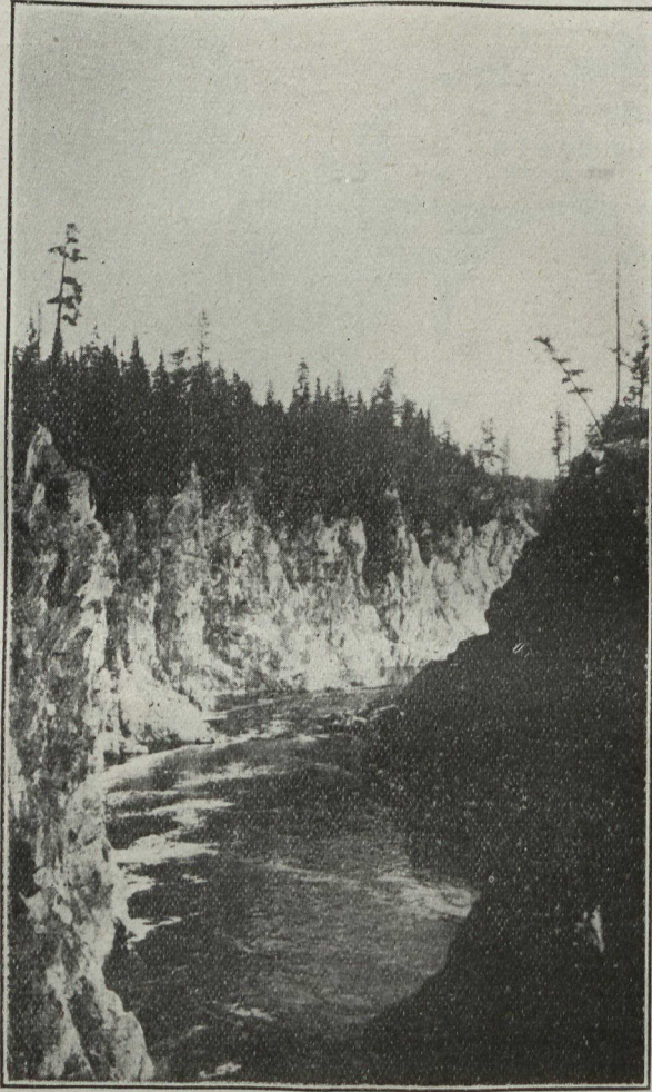
Gorge, Nepisiguit River, N.B.