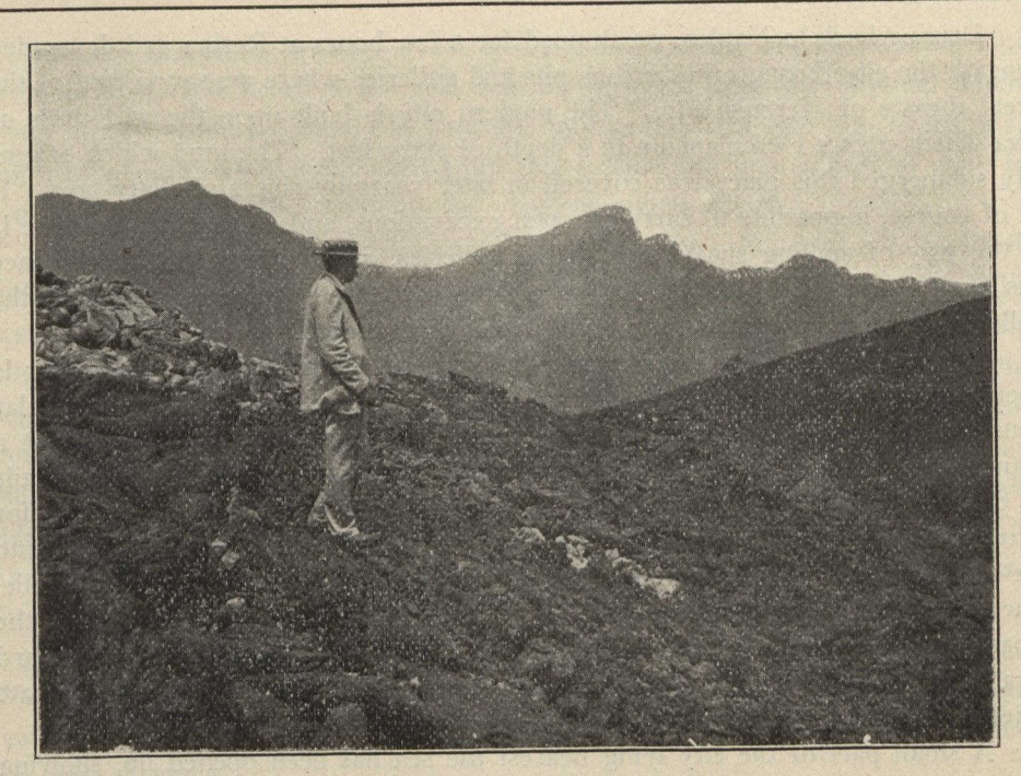
LAVA FIELD, CRATER OF VESUVIUS, A.D. 79.