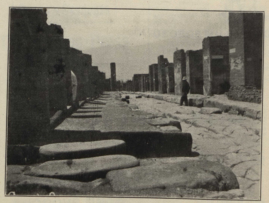
STREET SCENE, POMPEII.