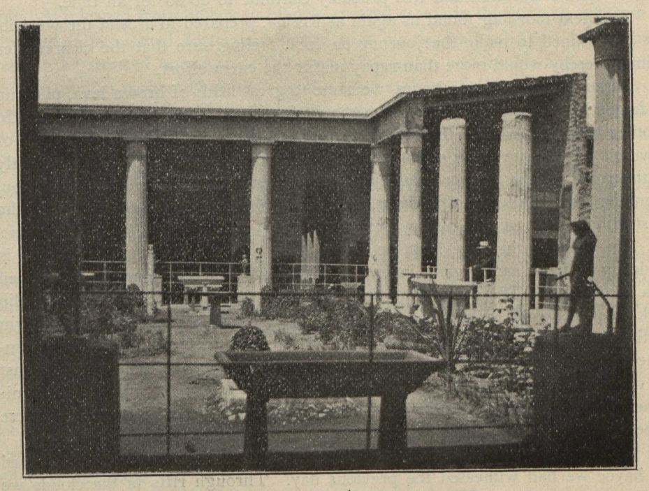
"NEW" HOUSE OR VETTI'S HOUSE, POMPEIL.