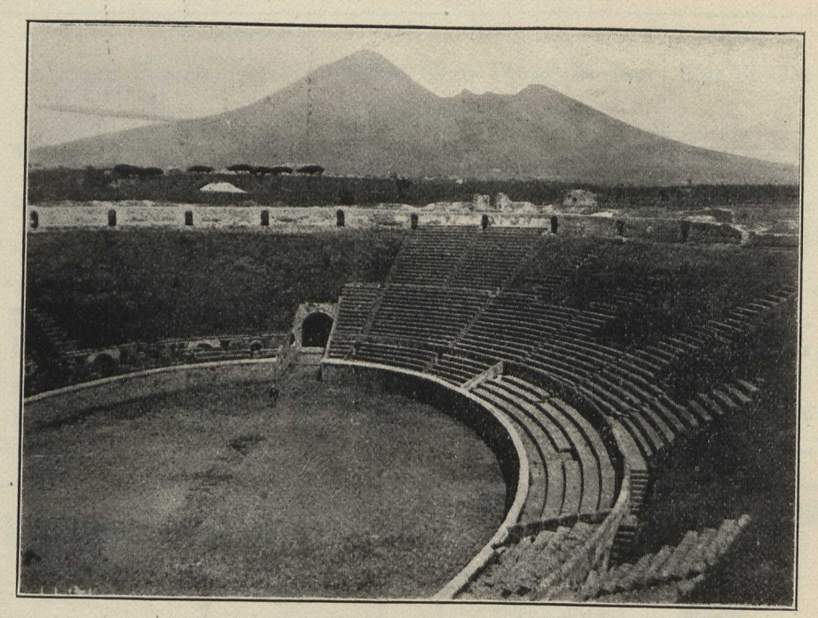
AMPHITHEATRE, POMPEII. VESUVIUS IN DISTANCE.