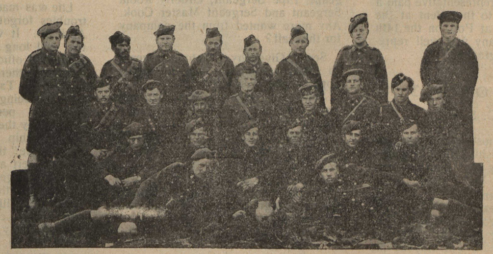
Members of the 91st Regiment, Canadian Highlanders of Hamilton, in The Canadian Scottish

For all this we have to thank in the first place the non-commissioned officers and men, both of the new drafts and of the old regiment, for the splendid manner in which they have put aside everything personal and worked together for the credit and honour of the 48th. The many new officers who came out a year ago generously threw