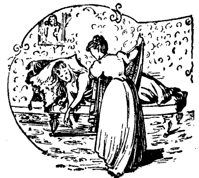
She lay on a couch like one dying.