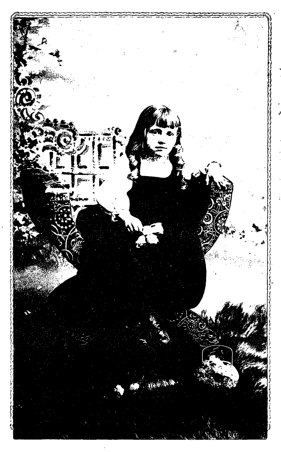
NEGATIVE ON STANDARD DRY PLATE PRINTED ON BRADFISCH & PIERCE ARISTOTYPE PAPER