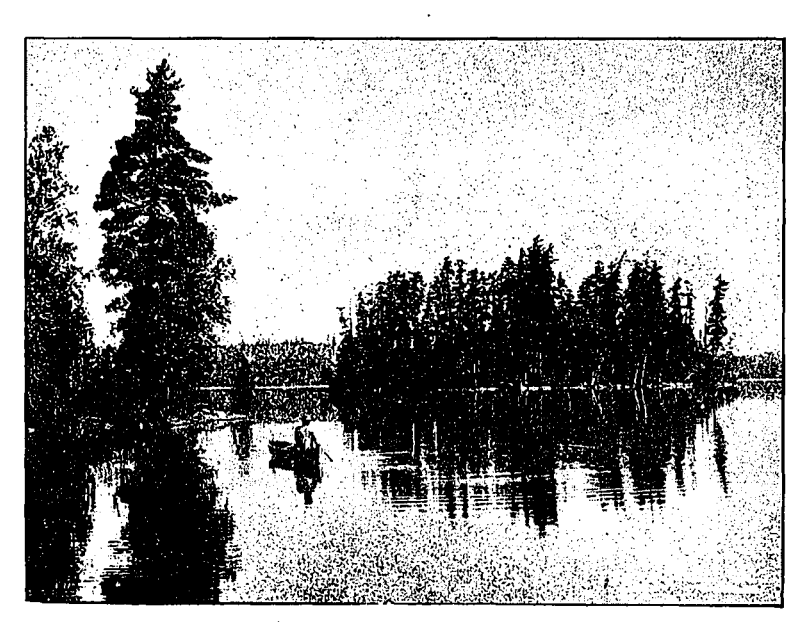
"SHADOWS," LAC DU FOND.