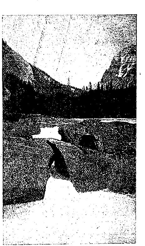
NATURAL ROCK BRIDGE.

engravings that accompany this article. "Narrows" are roads cut into steep banks, generally overhanging rivers, and running parallel thereto. The particular narrows represented are winding in their ways, and for other reasons there is generally only one point from which any particular view can be taken. It was so in this case, and I was fairly