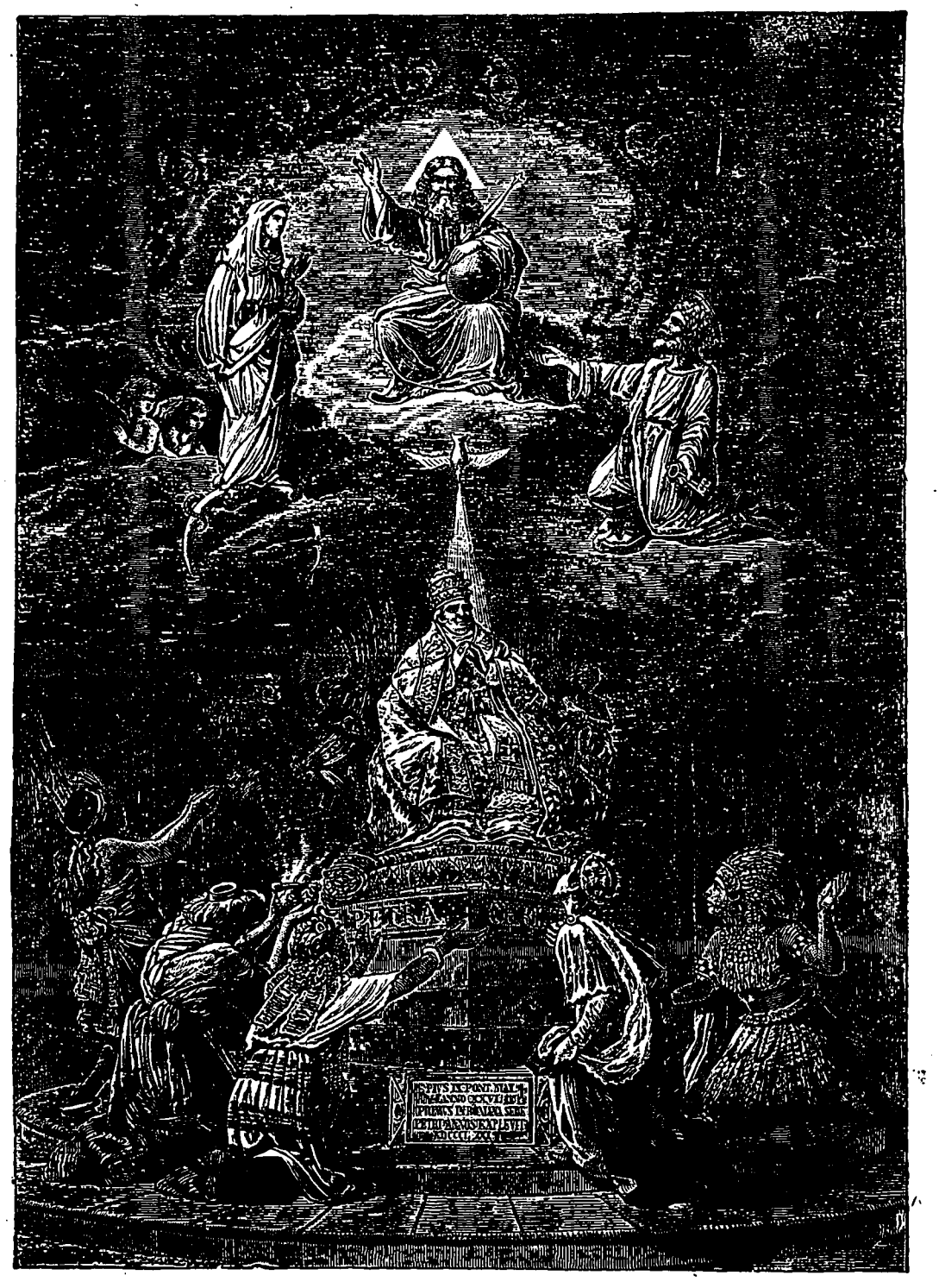
From the Great Picture in the Vatican at Rome, painted by command of Pio Nono. - See No. 1.