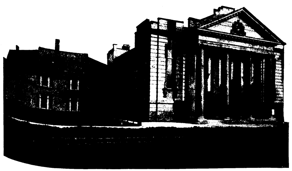
FIRST CONGREGATIONAL CHURCH, VANCOUVER

and those with whom he comes in contact. It was under his leadership nearly twenty-five years ago that the First Congregational Church of Vancouver was organized and held its earliest services in the old Wilson Hall, and it was with hearts full of crowding memories that some of the oldest members of the Church and congregation saw him mount the platform in