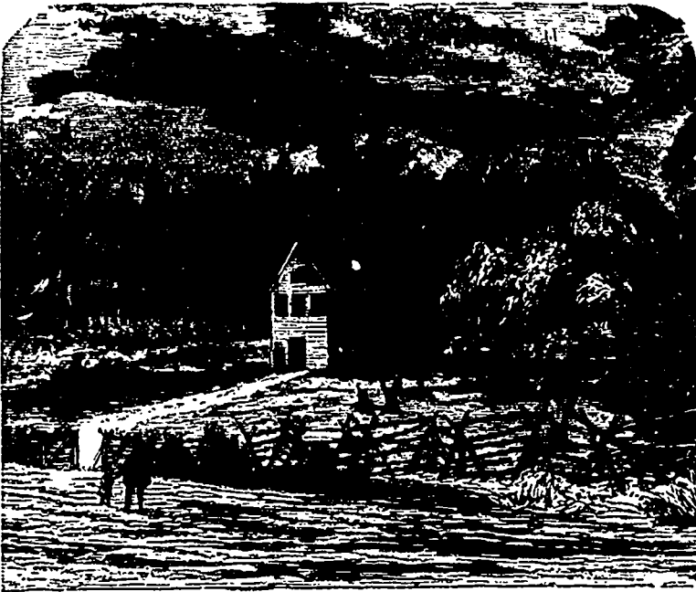
ST. JAMES', TORONTO, IN EARLY DAYS.

tempted was one for the endowment of the see, in order that the income of the Bishop might be assured to him for all time, independent of grants for missionary purposes made from other dioceses. At the Provincial Synod of 1883, the Bishop was able to state that the fund stood at $2,510. This was invested, and the interest added from time to time to the principal. This, coupled with further collections made by the Bishop, brought the fund up to $29,137.20 in 1886, which was increased to $30,000 in 1889, to $45,774.60 in 1892, and to $55,216.12 in 1895. It now yields a yearly income of about $2,500, which, added to the principal annually, will soon materially augment the fund. A portion of this income will doubtless be used before long for the payment of the bishop's stipend, and this will relieve the other dioceses of Canada of some of the grants that they have been making for that purpose, and thus enable them to do so much the more for more direct missionary work in Algoma.