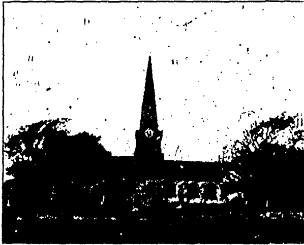
ST. MICHAEL'S, CHURCH, AUGHTON, Diocese of Liverpool, England.