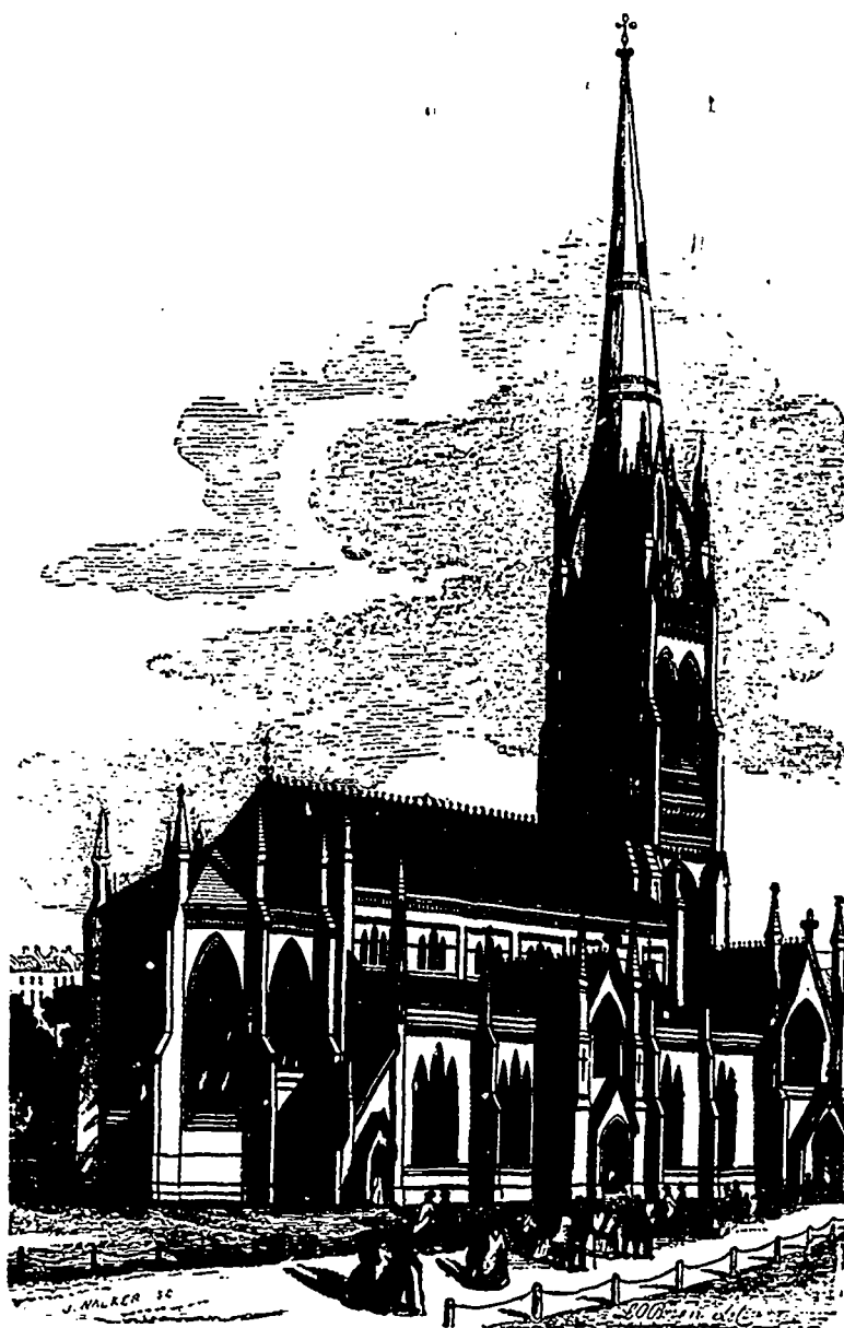
ST. JAMES' CATHEDRAL, TORONTO.