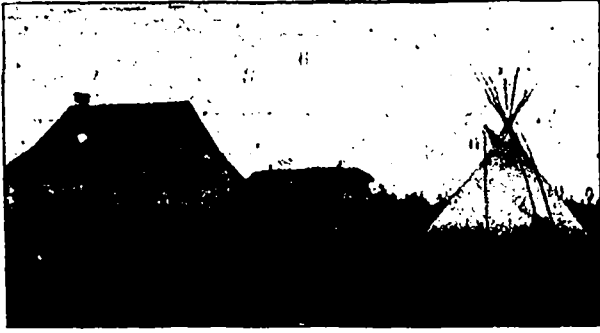
VALLEY RIVER SCHOOL. (See page 255.)

they seemed like machines working in a dull routine, without interest, and almost without consciousness.