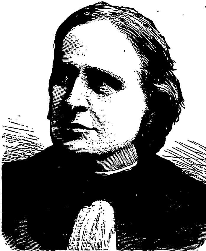
In Memoriam. Edward White Benson. Born. 1829; Bishop of Truro, 1876; Archbishop of Canterbury, 1882. Died, October 11th, 1896.

when His children go forth in faith. Not only will home work be well done, but probably better supported than before, and to each individual there will be a quickening of her soul that will cause her to realize the truth of Scripture when it says, 'He that watereth shall himself be watered.'