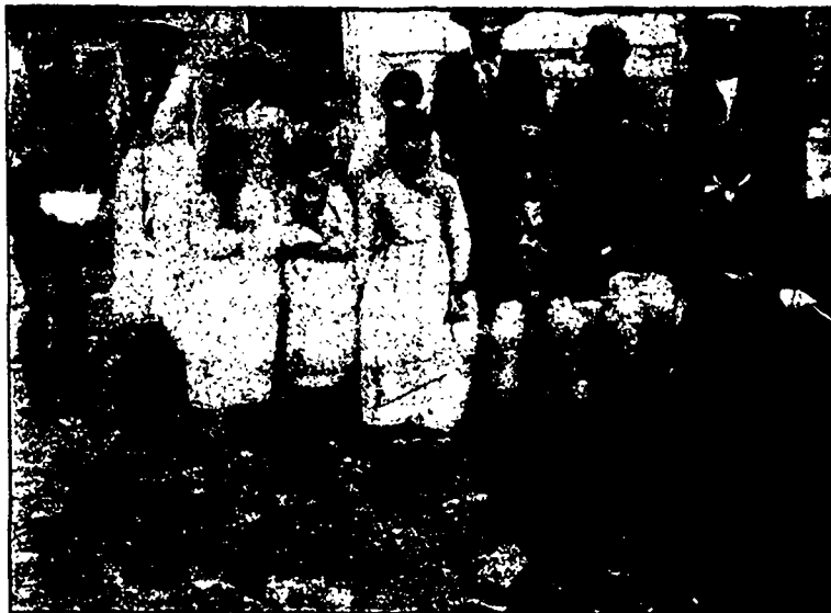
THE VALLEY RIVER SCHOOL, MANITOBA.