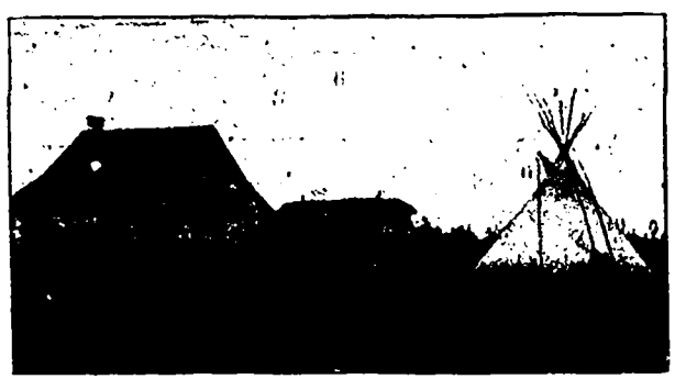
VALLEY RIVER SCHOOL. (See page 255.)

they seemed like machines working in a dull routine, without interest, and almost without consciousness.