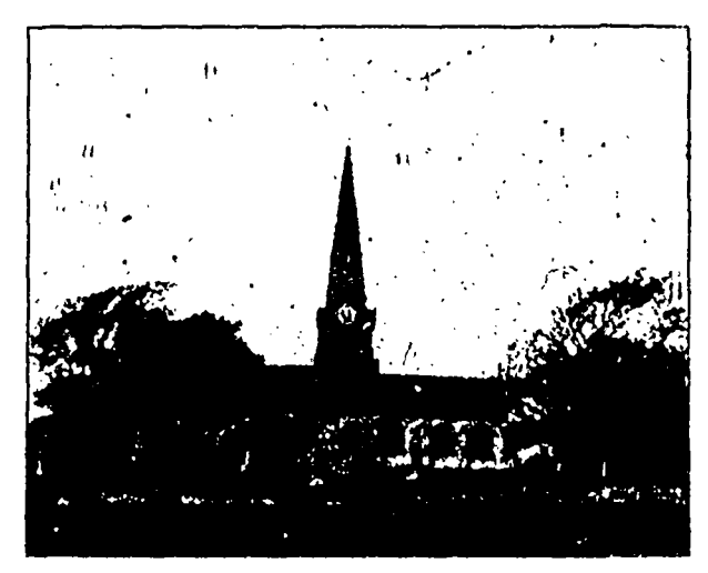
ST. MICHAEL'S, CHURCH, AUGHTON, Diocese of Liverpool, England.