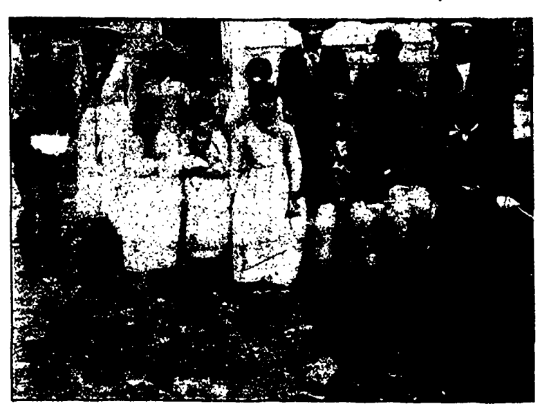
THE VALLEY RIVER SCHOOL, MANITOBA.