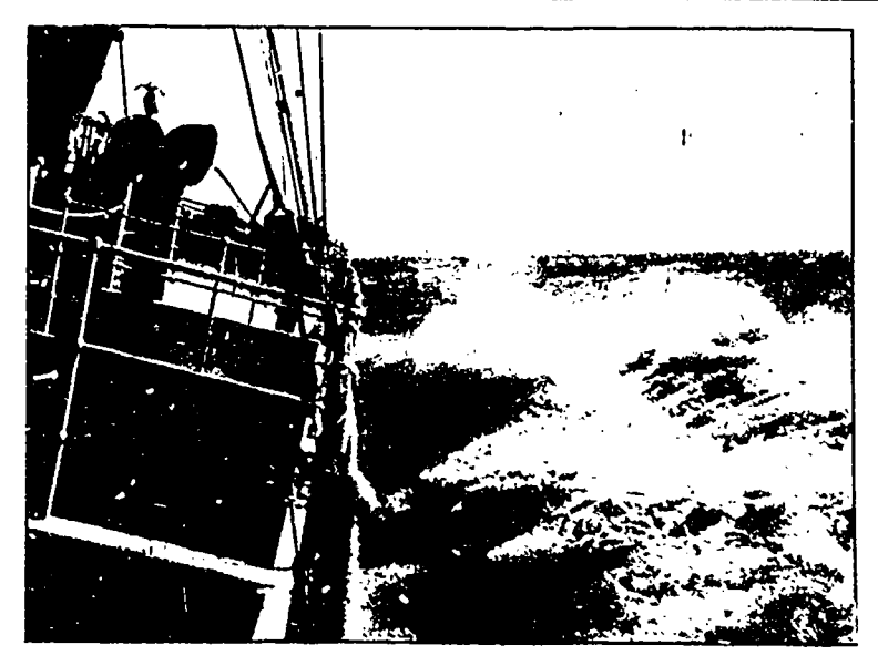
THE "LABRADOR" FIGHTING THE WAVES.

ized land, and had served as a missionary among real heathen. I then conceived the plan of going the second time to our great West, and making a more thorough acquaintance with the work among the Indians and the Chinese, hoping, by this means, to qualify my self for speaking as an interested observer of the heathen, if not as an actual missionary to them. The reply which I received from the S.P.G., after communicating my intention to the secretary, was in brief, "Go and come." Accordingly, with the consent of my bishop, I set out for British Columbia, and performed most of those journeys described in "The Camera in the Mission Field," learning as much as possible, in the time at my disposal, from white man, red man, and yellow man, and geting sunlight images of the latest and truest visible evidences of the good effect of Anglican missons in the newer parts of Canada.