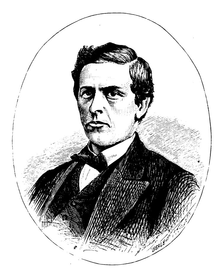
HON. L. S. HUNTINGTON.