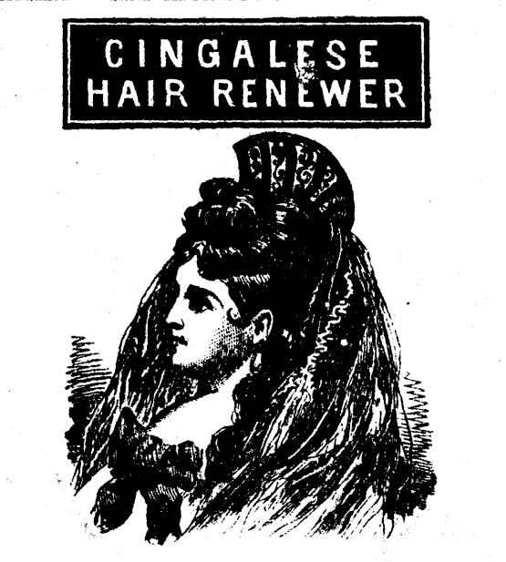
(TRADE MARK SECURED.)