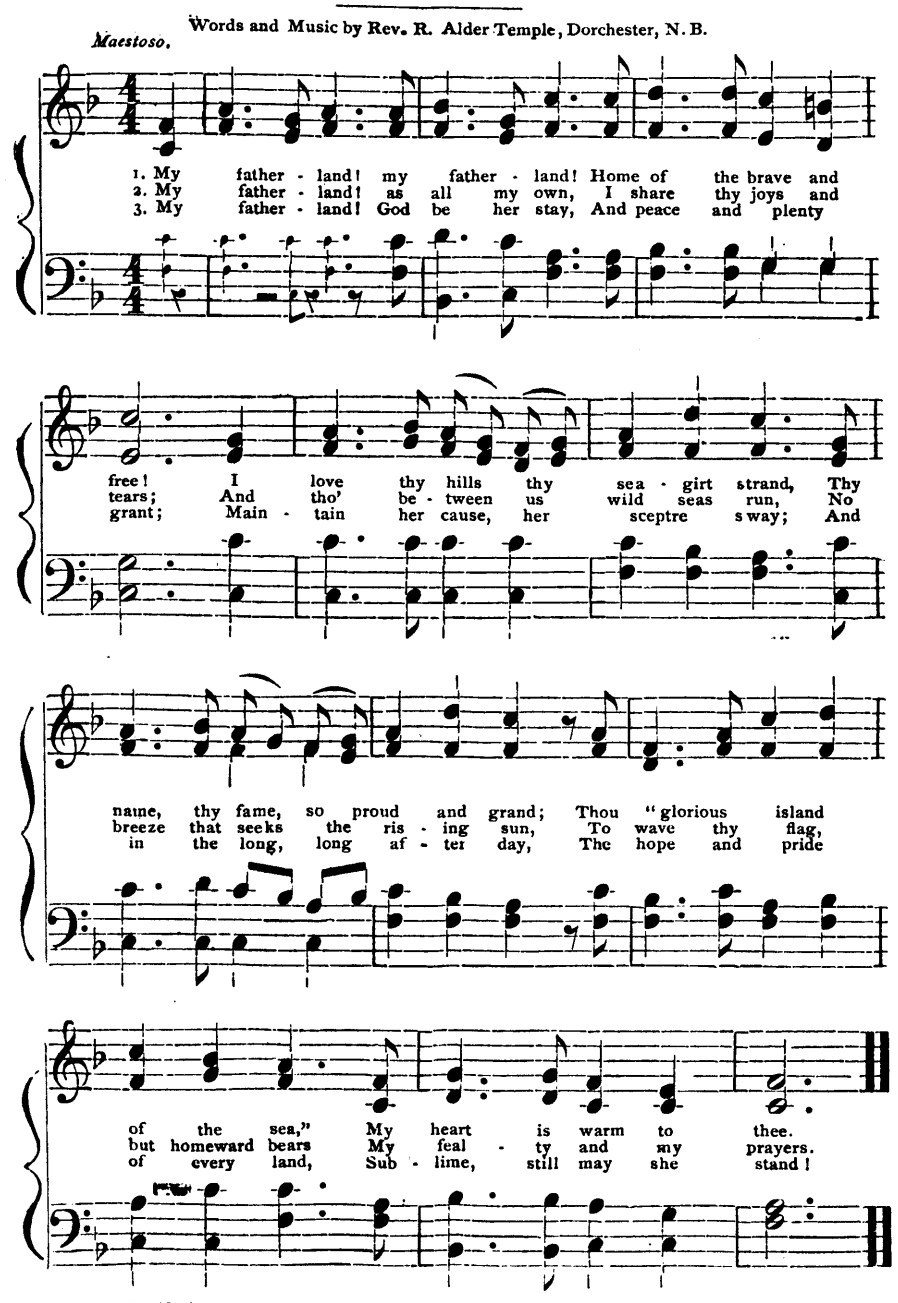
[The National Anthem, in the Key of F, may be sung as a Coda for the last verse.]