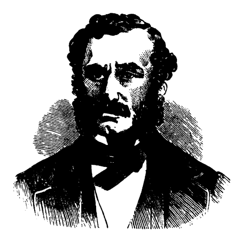
LT.-GEN. HON. JAS. LINDSAY.