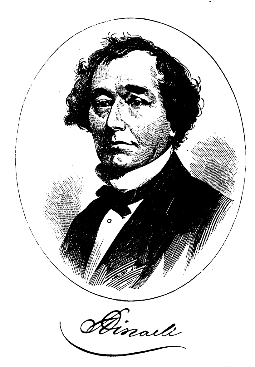
[See pag : 64.